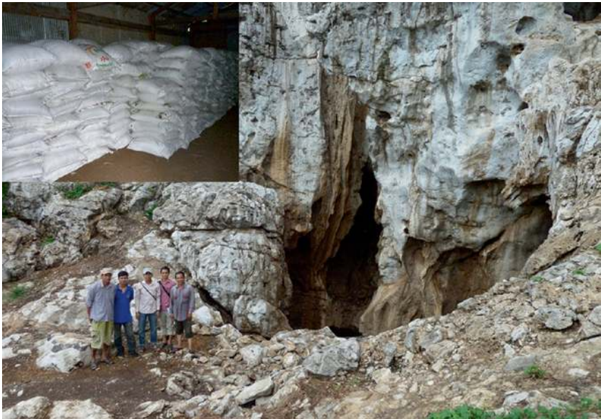
Fig. 15.9 Entrance to Tarum Cave in western Cambodia ( main picture ) where 200–400 sacks of bat guano ( inset picture ) produced by the largest colony of Chaerephon plicatus in the country have been harvested every month since 1995

Despite its widespread occurrence, accounts of the impact of guano harvesting upon cave-dwelling bats appear to remain largely anecdotal. This may stem in part from the difficulty of accurately monitoring large bat colonies, although rates of guano accumulation and harvesting records reflect their size (Fig. 15.9).