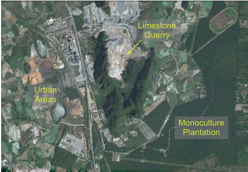
Fig. 15.6 Land use changes leading to isolation of the Gunung Kanthan karst outcrop in Ipoh, Malaysia (created by Kendra Phelps © Google Earth)

can pose an even greater threat due to the many other reasons that humans use caves (McCracken 1989) such as opportunistic recreation, camping, caving excursions, dumping refuse and use as storage facilities. For example, the importance of the Nietoperek fortifications in Western Poland as a bat hibernaculum was first brought to the attention of bat biologists outside the Iron Curtain by a Russian plan to dump radioactive waste there. The plan was shelved as a result of a successful campaign by conservationists. Throughout Poland, groups known as “bunkermen” meet socially in underground fortifications where they may disturb the bats.