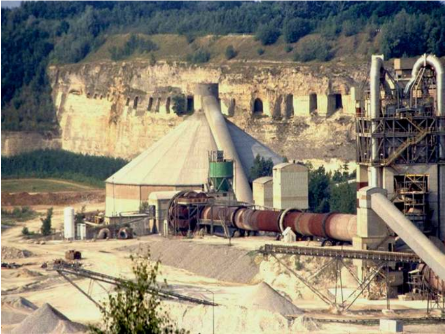
Fig. 15.8 Quarrying of limestone in the Petersburg mines of South Limburg, Netherlands

appears largely unevaluated so far, though such operations are widespread and commonly target cave sediments in countries such as Vietnam (N. Furey unpublished, Tordoff et al. 2004).