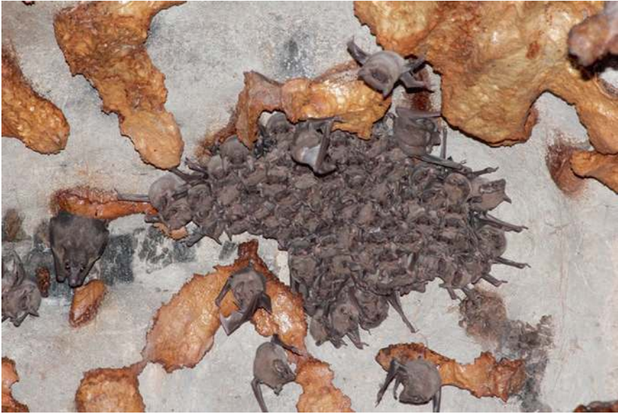
Fig. 15.3 Cave roost of Taphozous melanopogon in an erosion dome in Thailand (single bat to left of the main group is Eonycteris spelaea )

In a study of the cave complex in Ankarana National Park in the limestone massif of northern Madagascar, Cardiff (2006) found that longer caves, more complex caves, those with larger entrances or with entrances at lower elevation and those with less temporal variation in ambient temperature all had significantly higher bat species richness. In a similar study in the karstic Bemaraha National Park in western Madagascar, Kofoky et al. (2007) found that species richness and abundance was low in all but one of 16 caves—Anjohikinakina, which contained five species and over 9000 individuals of one. This cave was difficult to access and, unlike some of the others in the national park, was seldom visited by tourists.