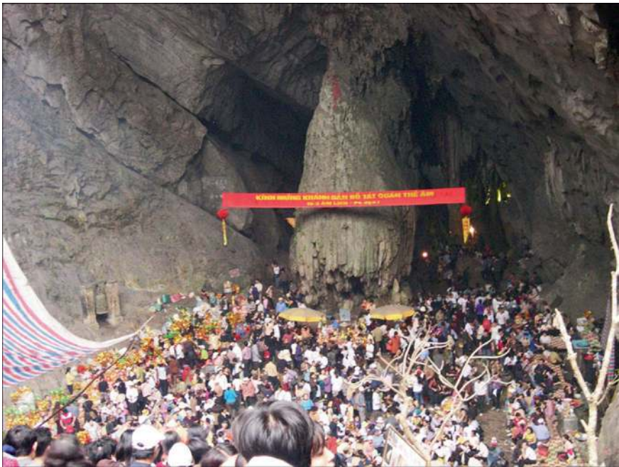
Fig. 15.11 Cave visitation during the annual Tet holiday in North Vietnam

Mann et al. (2002) explored behavioural responses of a maternity colony of 1000 cave myotis ( M. velifer ) by experimentally exposing the colony to cave tours. High light intensity had the most detrimental effect with bat activity levels and flight increasing with proximity to tour routes and when tour groups talked. All of these behavioural responses increased as the maternity season progressed. Consistent with this, in a review of 225 subterranean sites in China, Luo et al. (2013) showed that recreational activities had pronounced detrimental effects on the numbers of bat species and presence of species of special conservation concern. Almost 90 % of the sites were found to be disturbed and only 15 % of natural caves were unaffected by disturbance. Concerns about the impact of cave tourism on Chinese bats have also been raised by Niu et al. (2007) and Zhang et al. (2009)