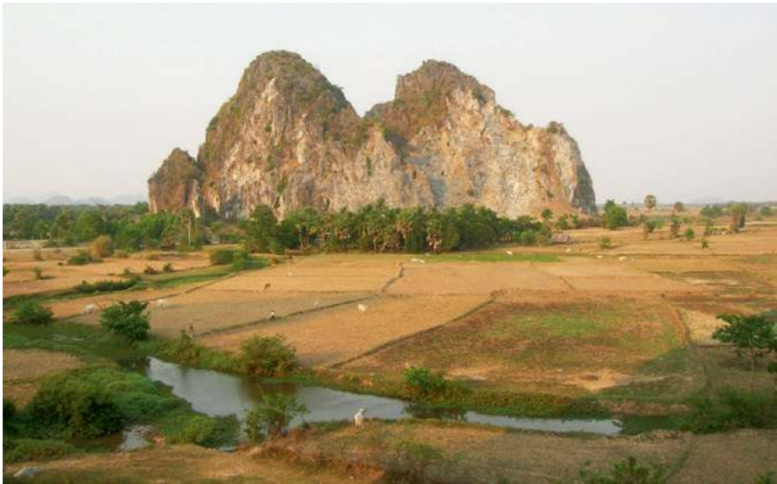
Fig. 15.7 Quarrying of limestone hills in southern Cambodia

Limestone quarrying for cement and construction materials presents a severe threat to cave-dwelling bats in karst areas as it can result in the total loss of outcrops (Fig. 15.7), leaving few options for remediation. Global demand for cement alone was projected to increase by 4.1 % per annum to 3.5 billion tons in 2013 despite the western financial crisis (Sutherland et al. 2012) (Fig. 15.8). This is believed to pose perhaps the greatest threat to cave bats in Southeast Asia, as the region has the highest annual quarrying rates in the tropics and these appear to be increasing faster than in other regions, at 5.7 % per year (Clements et al. 2006; Kingston 2010). In contrast, the impact of smaller artisanal mining operations