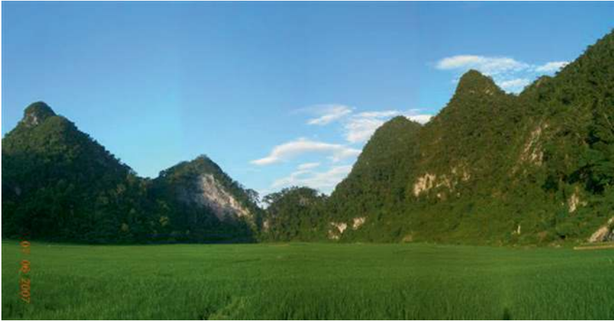
Fig. 15.4 Forested karst hills surrounded by wet rice cultivation in North Vietnam