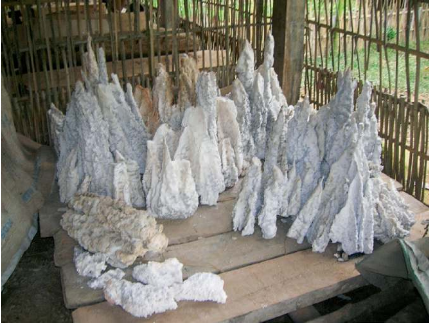
Fig. 15.10 Sale of decorative cave speleothems near the Vietnam-China border

It is generally acknowledged that insensitive harvesting operations can be highly detrimental to cave bat populations (Hutson et al. 2001), particularly where cave modifications are undertaken to facilitate guano extraction (Elliot 1994). Similar concerns apply to the harvesting of cave swiftlet ( Aerodramus spp. and Collocalia spp.) nests in Southeast Asia (Suyanto and Struebig 2007) since trade in these has expanded greatly in recent decades, causing significant disturbance to bats sharing the same caves (Wiles and Brooke 2013). In both instances, the perceived benefits of continued harvests can encourage local communities to protect the producers (Leh and Hall 1996; Bates 2003), although research to identify and validate sustainable harvesting practices is clearly needed. Lastly, harvesting of speleothems for decorative purposes represents another widespread practice in Southeast Asia whose impacts on cave bats appear to remain largely unevaluated (Fig. 15.10).