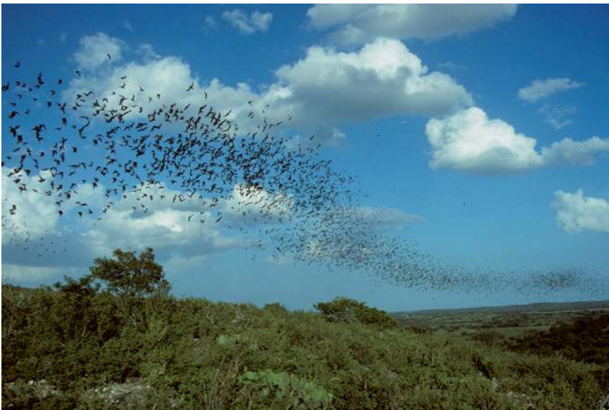
Fig. 15.2 Evening emergence of T. brasiliensis from Frio cave in Texas, USA

The survival of many bat species worldwide depends upon natural caves and other underground sites such as mines (Mickleburgh et al. 2002). For instance, of