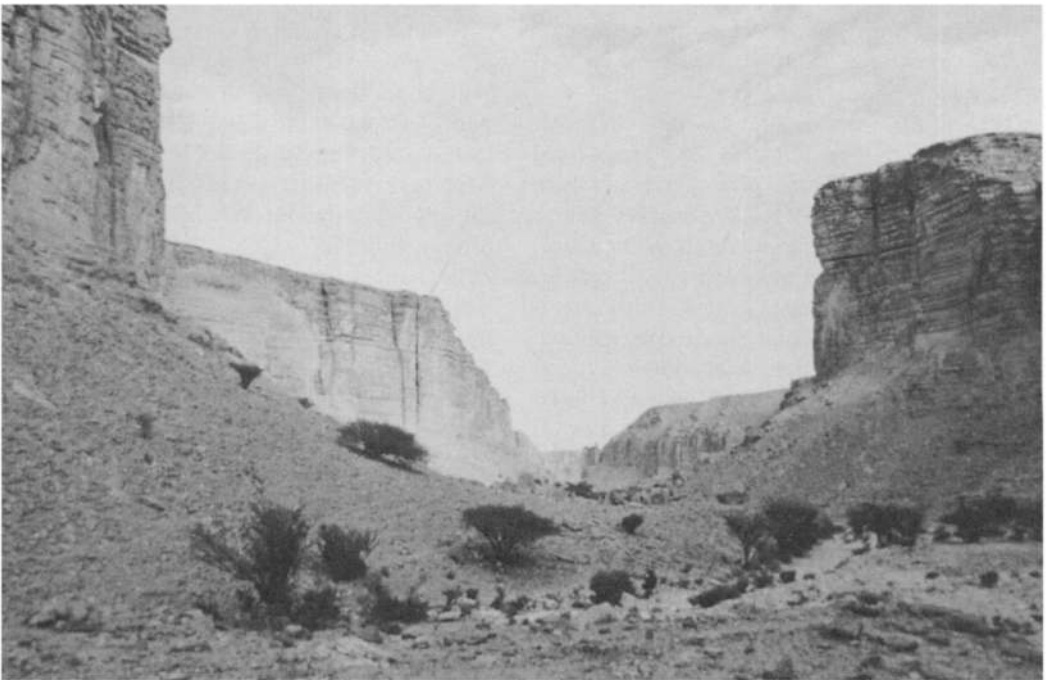
Hawtah Bani Tamim (Chris Thouless).

One of the main aims of the Commission is the establishment of a system of protected areas. A system plan has been prepared by an IUCN consultant; this sets out the rationale and guidelines for a comprehensive protected-areas system. It includes 103 existing and proposed terrestrial and marine sites, accounting for 8.1 per cent of the Kingdom's total area, and covers all the major biomes of the country.