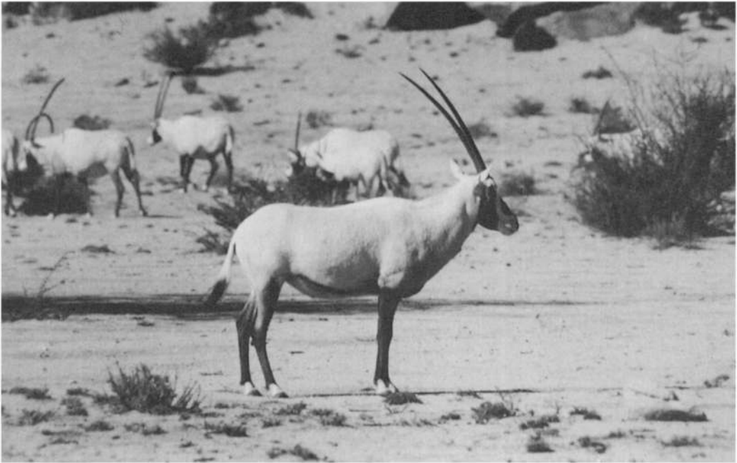
Arabian oryx at the National Wildlife Research Centre.

However, most of the reserves established to date have resulted from personal interest of NCWCD's board of directors in particular areas, rather than from their priority in the system plan.