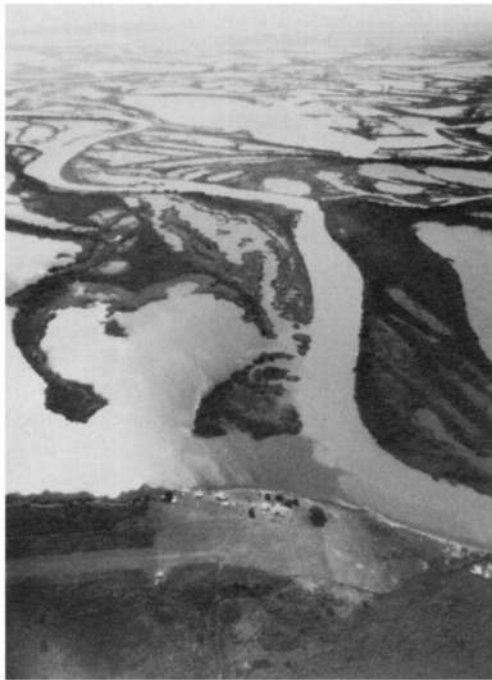
Aerial view of the Pantanal in the month of August (Russell A. Mittermeier).

growing rapidly; and illegal hunting of caimans.