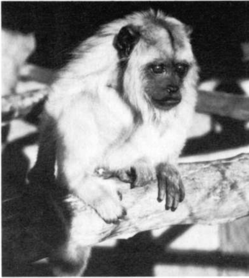
Juvenile black howler monkey, one of the few primates in the Pantanal (Russell A. Mittermeier).

Gold-mining. In the mid-1980s gold was discovered at the edge of the Pantanal in Mato Grosso near Poconé, and gold-mining has been in operation since. Mining presents a number of threats including considerable siltation and erosion that result from dredging river banks and bottoms, and pollution from the mercury used to separate out the gold. The state of Mato Grosso ranks second, behind Pará, in Brazil's gold production. In 1985, both the Couros and Agua Branca rivers, which feed the Coxipó River, a tributary to the Cuiabá River, were discovered to be absent of life because of pollution from mining activities. In recognition of the great threat presented by gold mining, the Governor of Mato Grosso is taking steps to eliminate mining from the region.