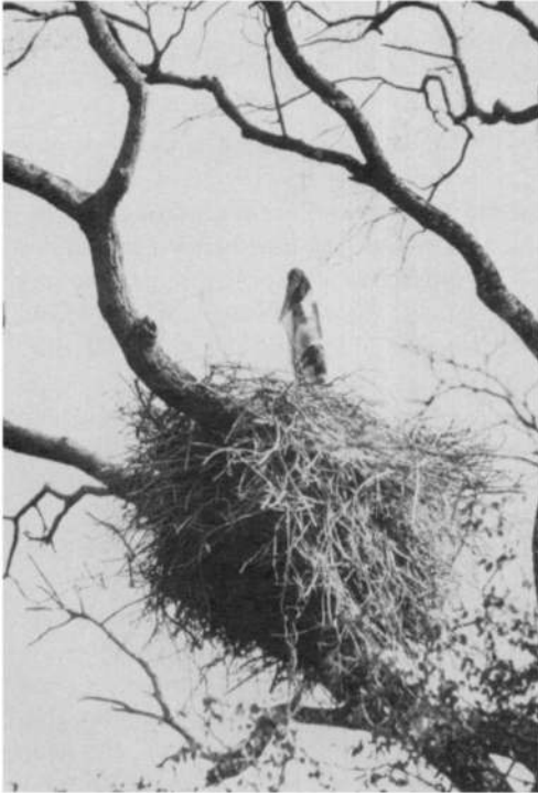
Jabiru stork on nest in the Pantanal.