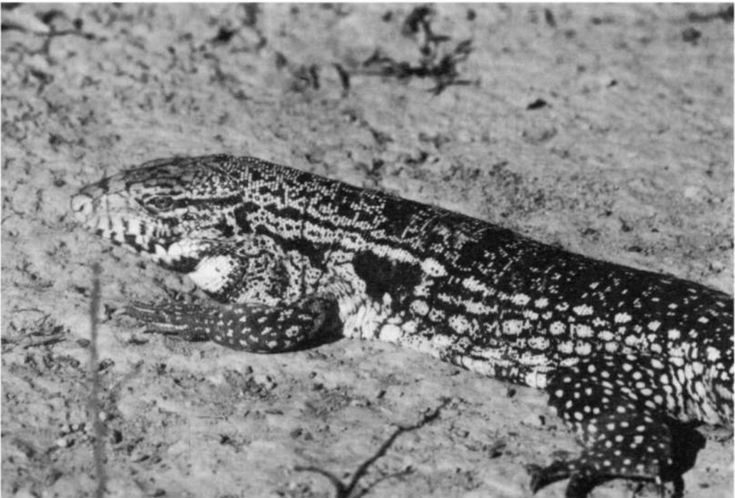
Tegu lizard, one of the many reptile species in the Pantanal ( Russell A. Mittermeier ).