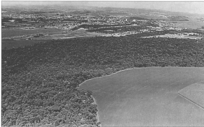
Aerial view of the Santa Genebra Reserve, Campinas, south-east Brazil, where ecological studies have been carried out with brown howler monkeys ( N. Chinalia ).

least seven fruits are dispersed mainly by brown howlers ( Callophylum brasiliensis , Chrysophyllum sp., Cordia ecalyculata , Ocotea corimbosa , Cryptocarya moschata , Copaifera langsdorffii and Annona cacans ). Howlers, therefore, may be important in the maintenance of seed dispersal of plants with large fruits in small areas that cannot support large and specialized frugivores.