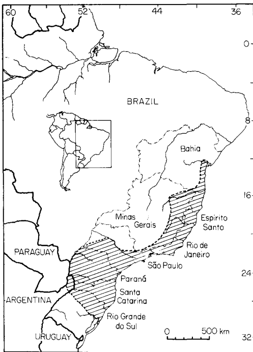
Figure 1. Approximate geographical distribution of the brown howler monkey (hatched area), based on museum specimens and field observations.

example, recently discovered that populations of both subspecies occur on the right bank of the Rio Jequitinhonha in north-eastern Minas Gerais (Figure 2), a region where A. f. clamitans was not known to occur previously (Ihering, 1914; Cabrera, 1958; Kinzey, 1982).