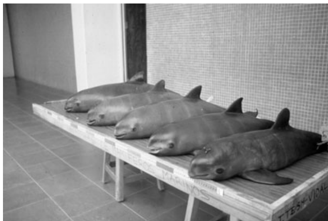
Fig. 4. Five vaquita calves awaiting necropsy at the ITESM-Guaymas laboratory. The calves were killed in gill nets set for totoaba, near El Golfo de Santa Clara, March–April 1991.