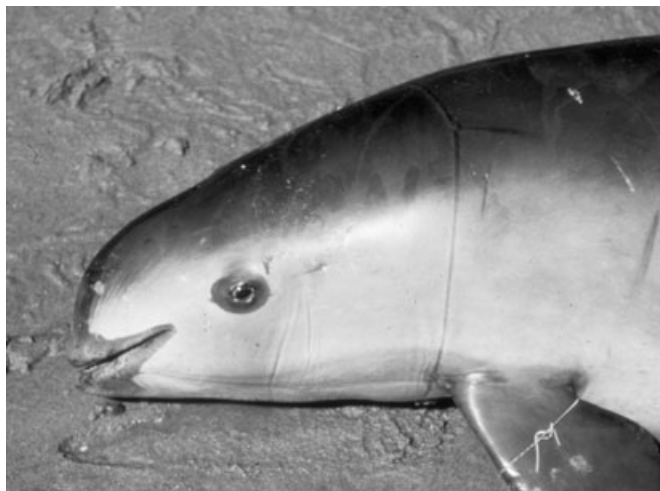
Fig. 1. A vaquita showing the head and anterior pigmentation pattern. Note the dark grey dorsal cape and the pale grey lateral field. The most conspicuous features are the relatively large black eye and lip patches. This animal died in an experimental totoaba fishery and was landed in El Golfo de Santa Clara, March 1985.

Only four living species comprise the genus Phocoena , two in the Northern Hemisphere (the vaquita and the harbour porpoise P. phocoena ) and two in the Southern Hemisphere (the spectacled porpoise P. dioptrica and Burmeister's porpoise P. spinipinnis ). All are small in body size and coastal in distribution (although there is some evidence to suggest that the spectacled porpoise has a partly offshore distribution; Brownell & Clapham, 1999a). Another common feature of the four species is that they are highly vulnerable to incidental mortality in gillnet fisheries (Jefferson & Curry, 1994). There is no reason to suppose that the vaquita is any more, or less, susceptible to accidental entanglement in gill nets than any other