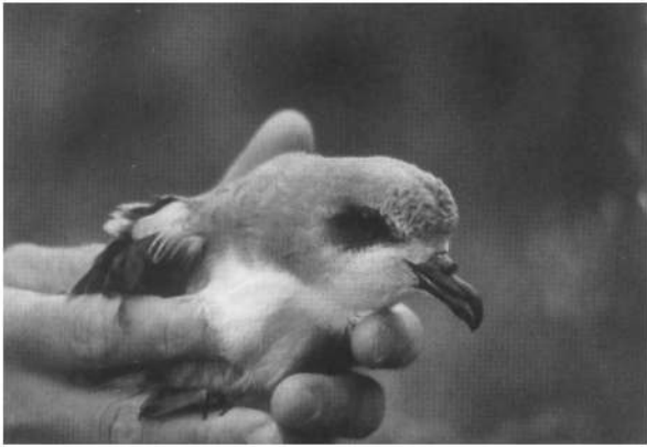
Plate 1 Zino's petrel Pterodroma madeira showing its distinctive black eye mark (Francis Zino).

P. m. deserta should be treated as a distinct species, but had difficulty in accepting that P. m. madeira , should also be considered as such (Bourne, 1957). In 1975, P.A. Zino considered the bird a distinct species (letter to W.B. King). Bourne (1983) formally proposed the separation of the subspecies into the following species: P. madeira , endemic to Madeira, P. feae , restricted to Bugio and the Cape Verde Islands; and P. mollis , of the Southern Ocean. Imber (1985) and Warham (1990) later confirmed this status. Recent DNA studies on blood samples from Zino's petrel and Fea's petrel confirm that they are distinct species (Nunn & Zino).