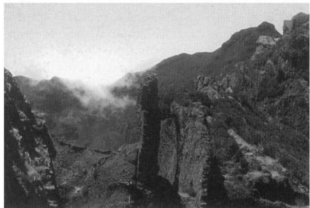
Plate 2 The Central Mountain Massif (Francis Zino).