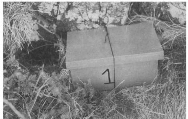
Plate 3 Rat bait box in position on a ledge.

In order to monitor rodent activity and improve the control programme, the 65 boxes in the cordon have been checked weekly since February 1989. At each visit, the percentage of bait removed by rat or mouse was estimated within one of five classes, and chewed or damaged blocks were replaced. These data have been used to prepare an index of bait uptake for the years 1989–97. Preliminary analyses have been made to investigate bait uptake in relation to seasonal variations in temperature and rainfall. The uptake at individual boxes has been used to study the effectiveness of box position in relation to surrounding vegetation height, type and percentage cover, as well as altitude, general aspect and distance from the nearest neighbouring bait box.