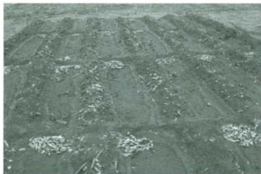
Fig. 3 Soil and water sinks formed by Tied ridges in Mbeere, Eastern Kenya. Picture taken on 12th April 2007 after 77 mm of rainfall 15 h earlier. Rings around the basins represent silt and SOM retained rather than washing away in runoff

evident (Evans et al. 1996) but also depending on the rainfall regime (Gameda et al. 1994). The next challenge in no-till farming is weed management in systems where chemical control is not viable.