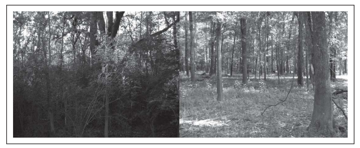
Figure 3. A riparian forest with a dense understory of Chinese privet (left), and the same forest five years after privet was removed (right). The forest following privet removal had much higher numbers of individuals and species of bees and butterflies than uncleared forest (Hanula and Horn 2011a, 2011b; Hudson et al. 2013).

ests and along roadsides have the potential to facilitate nonnative plant invasion. As many nonnative plants are favored by open and disturbed conditions, the establishment and spread of these species may be facilitated by reductions in tree and shrub cover (Jenkins and Parker 2000; Dodson and Fiedler 2006; Aubin et al. 2007; Shields and Webster 2007; Burke et al. 2008; Hausman et al. 2010) as a result of increased resource availability (e.g., light) and decreased plant competition (McEvoy et al. 1993; D'Antonio and Meyerson 2002). Since nonnative plants frequently occur along roadways, roads can act as conduits for their spread (Greenberg et al. 1997; Gucinski et al. 2001) and invasion into neighboring habitats (Gelbard and Belnap 2003; Christen and Matlack 2009; Birdsall et al. 2012). More research is needed, but the potential for increased threats from invasive plant species following management aimed at improving conditions for pollinators should be anticipated and, ideally, included in management plans.