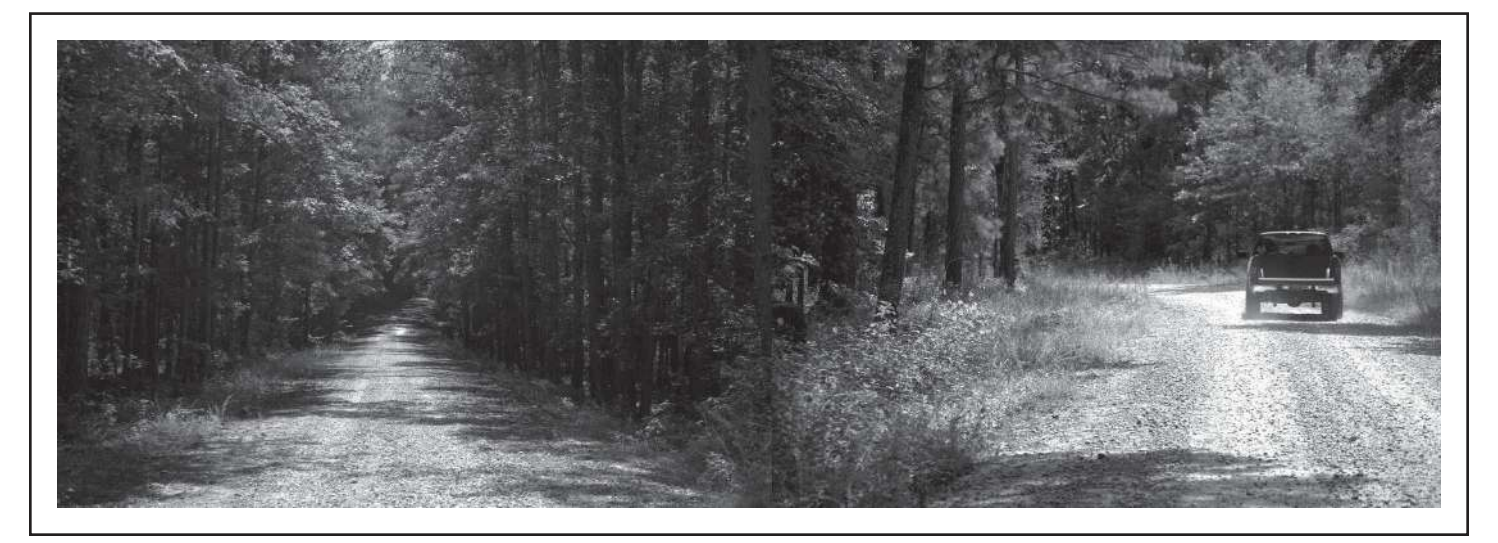
Figure 2. A forest road with dense stands on both sides shading the road (left), making it less suitable for pollinators. Right photo is a similar road with wider edges and thinned stands, allowing in more light for plants and pollinators.

In addition to providing floral and larval host plant resources, roadside and powerline habitats also have the potential to benefit pollinators by providing corridors for movement (Fye 1972; Munguira and Thomas 1992; Hopwood 2008; Haddad et al. 2011; Skórka et al. 2013; Jackson et al. 2014). Most solitary bees have limited foraging distances (Gathman and Tscharntke 2002; Zurbuchen et al. 2010), therefore roads and powerlines with adequate nesting habitat and forage could provide their complete habitat needs. The benefits of roads and powerlines as habitat corridors depend on the pollinator species. Corridors were beneficial for movement of most butterfly species between habitat patches but had no