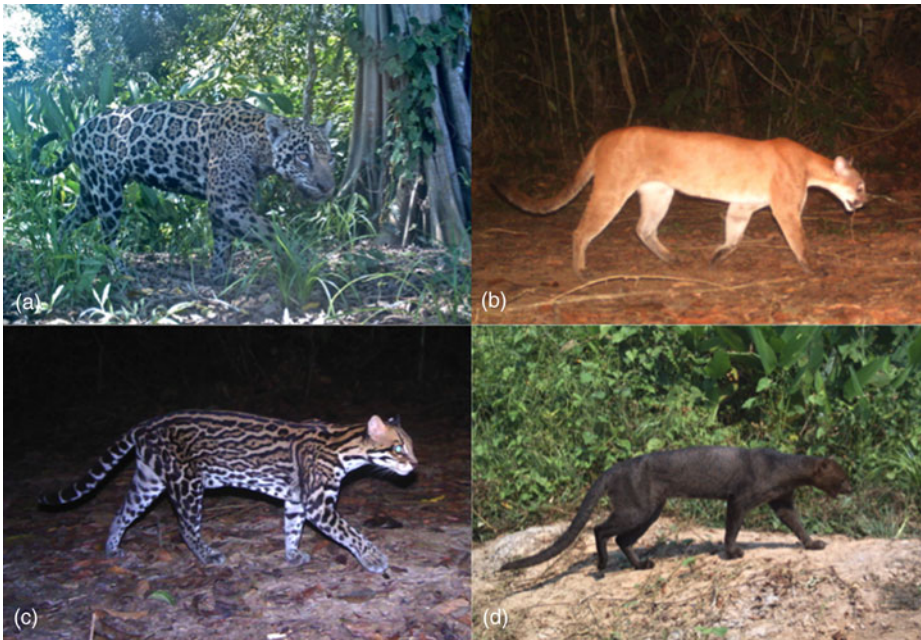
PLATE 1 Felid species recorded by camera traps across the study site in the Magdalena river valley of Colombia: (a) jaguar Panthera onca , (b) puma Puma concolor , (c) ocelot Leopardus pardalis and (d) jaguarundi Herpailurus yagouaroundi .