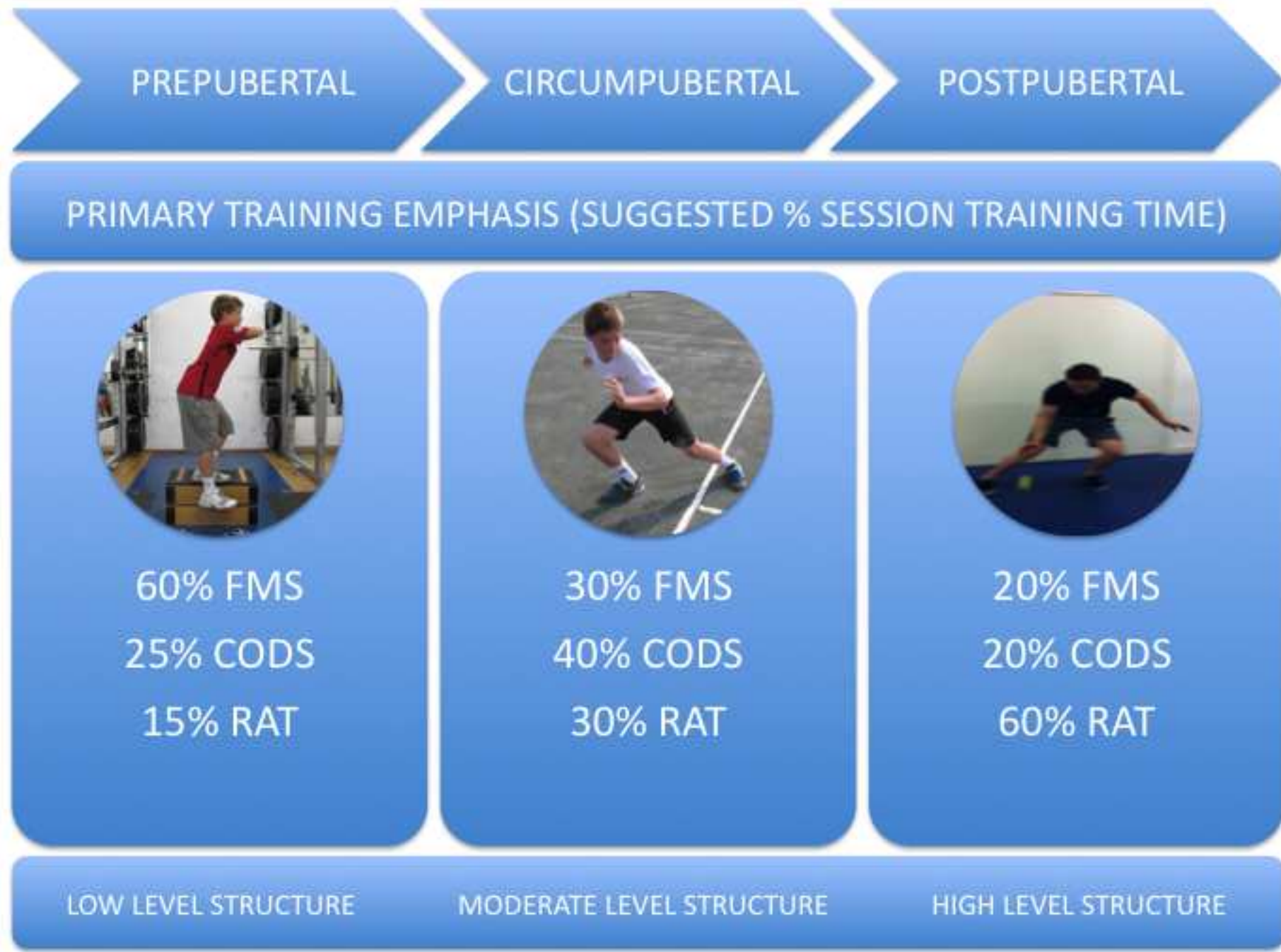
Figure 1 Click here to download high resolution image