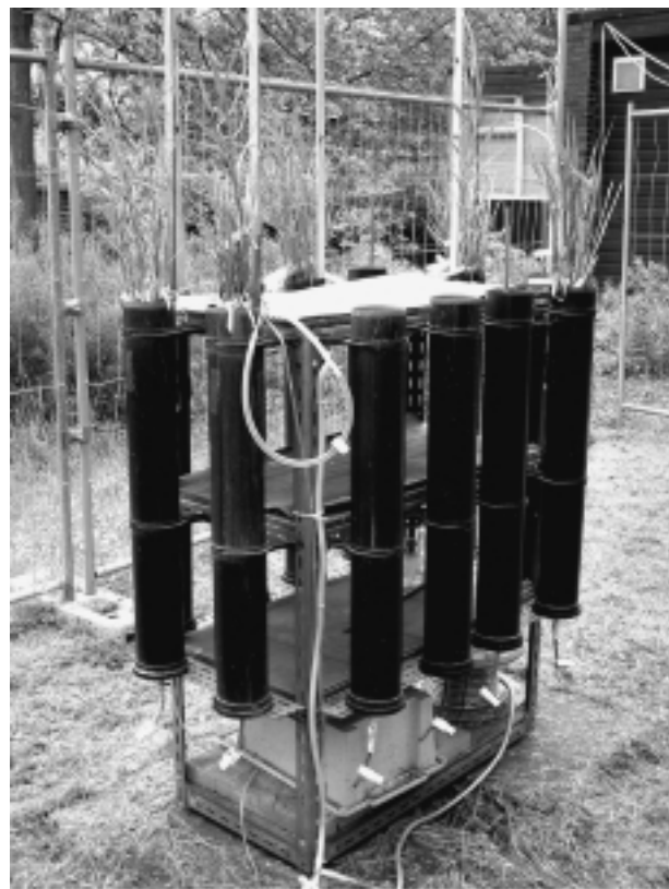
Figure 1. Constructed treatment wetland rig (The King’s Buildings campus; The University of Edinburgh) in May 2004.