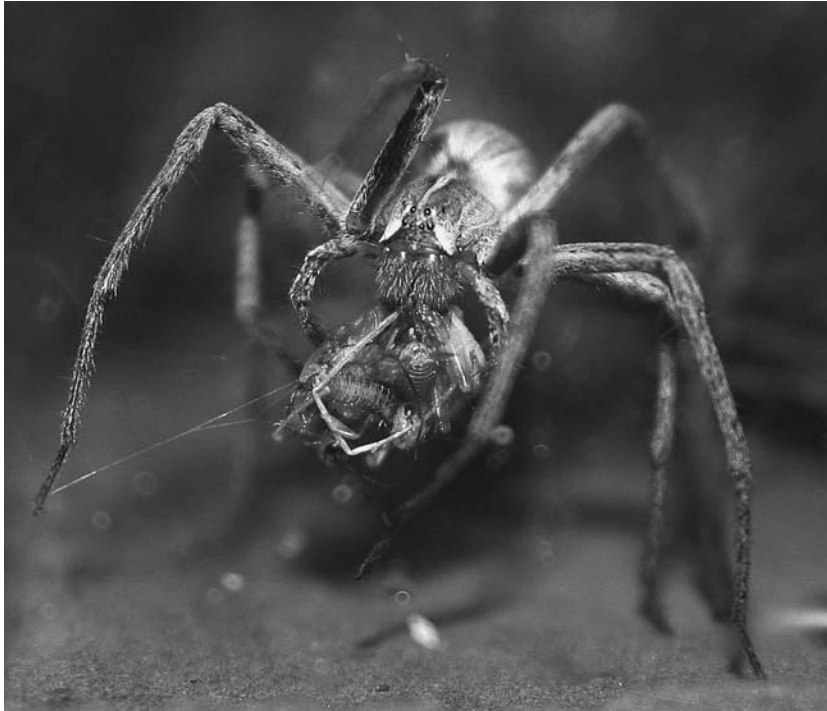
PLATE 1. Predator–prey interaction between the lycosid spider Pisaura mirabilis and the cricket Gryllus assimilis .