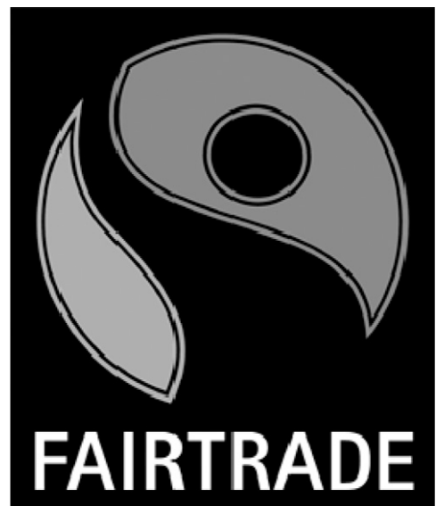
Figure 2. International Fair Trade Certification Mark by the Fair Trade Labeling Organizations International

After allowing respondents to read the information related to fair trade, a payment card contingent valuation question was adopted to elicit consumers’ willingness to pay. In the past, conjoint methods have been used when estimating WTP for fair trade products (Basu and Hicks, 2008; Pelsmacker et al., 2005). Nevertheless, Stevens et al. (2000) concluded that in many cases, results from a contingent valuation