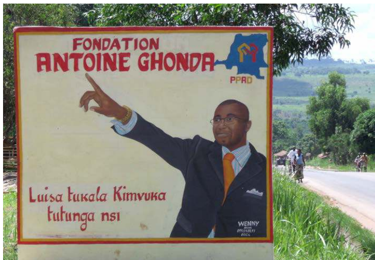
Photo 6.1 Sign in a village in the constituency of MP Antoine Ghonda in Bas Congo province ('Antoine Ghonda Foundation - join the effort to reconstruct the wealth of our country together') December 2009.