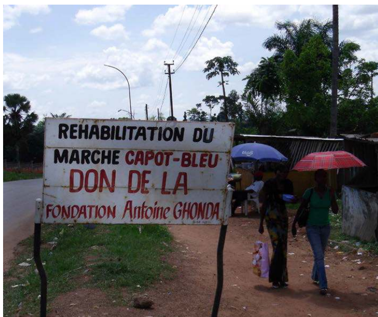
Picture 6.2 Sign in a village in the constituency of MP Antoine Ghonda in Bas Congo province ('rehabilitation of the market 'Blue Bonnet' provided by the Antoine Ghonda Foundation') December 2009.