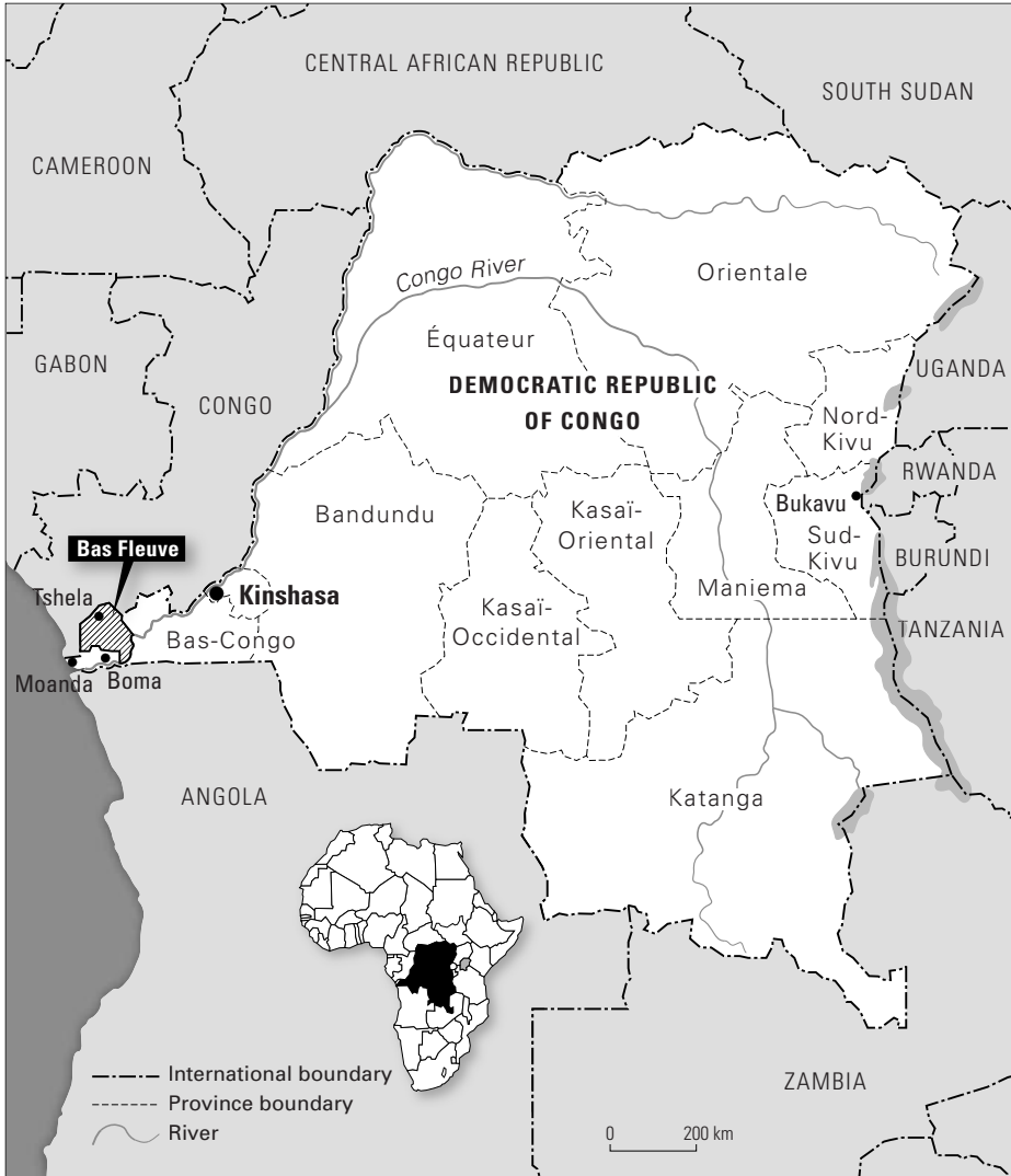
Map 1.1 Democratic Republic of Congo