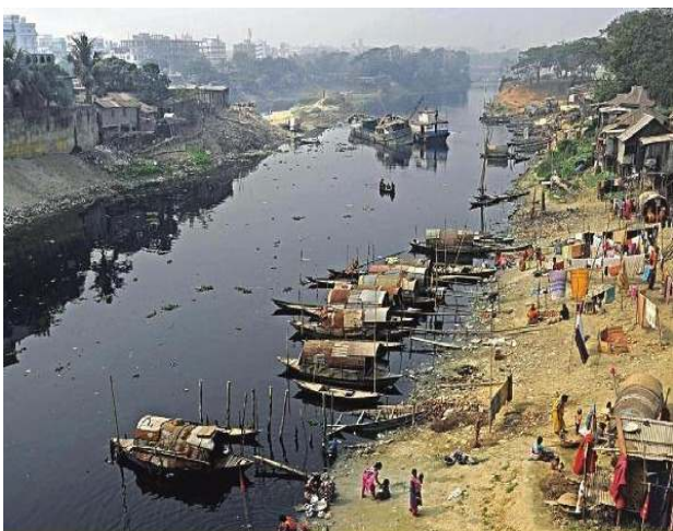
Figure 5. Pitch black water of Turag river, the west of Tongi Bridge, Dhaka, Bangladesh.