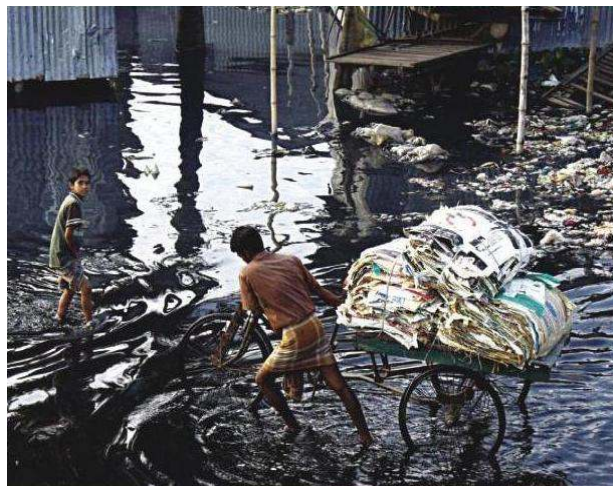
Figure 6. Pitch black water discharges from textile dyeing units in low deep canal that link with Turag river.