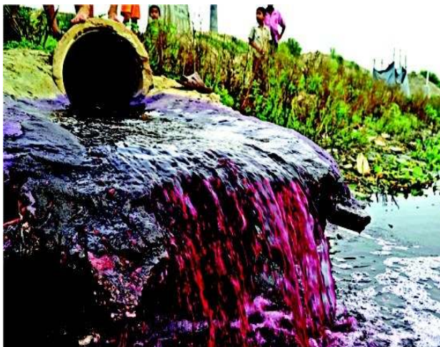
Figure 3. Textile wastewater discharge in Turag river.