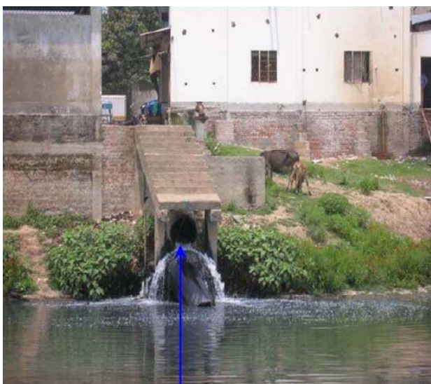
Figure 4. Industrial wastewater discharge in Turag river.