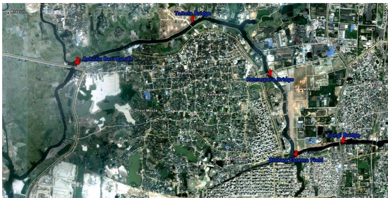
Figure 2. Location of coordinates of different sites in Turag river.