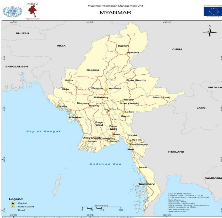
Figure (1): Map of Myanmar. [17]

In January 2016, nineteen trained interviewers administered structured interviews by using pre-tested and modified questionnaires. It consisted of 3 components: household information, household members' demographics and information about drinking water sources. The interviews were conducted in Myanmar language and each interview lasted for 7 to 10 minutes. Each household was assigned a unique ID number.