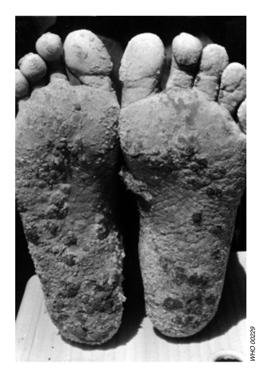
Table 1. Percentage of groundwaters surveyed in 1998 by the British Geological Survey with arsenic levels over 50 \mu g/l

Fig. 1. Skin lesions due to arsenic poisoning