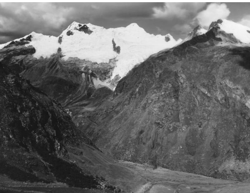
FIGURE 3 Yanapaccha (5460 m) from Pisco basecamp region (Schneider, 1939)