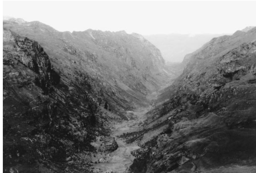
FIGURE 5 Q. Honda from Portachuelo (Kinzl, 1932)

Park authorities suggest that preservation of this particular forest in the Pisco valley is the result of management interventions imposed since 1975 (Valencia, personal communication), and recent efforts to re-establish Polylepis along trails and hillslopes were observed. Ground-truth examination within the forests, however, shows that they are located on ancient blockfields, which, by all appearances, are and have been for centuries inaccessible to cattle. The results from a 400-m 2 sampling plot (Table 1) show that natural regeneration processes are high within the forest