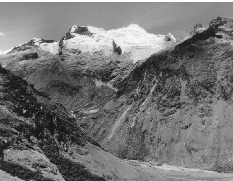
FIGURE 4 Yanapaccha (5460 m) from Pisco basecamp region (Byers, 8 September 1997)

vate collections in Huaraz, the latter of which will ultimately permit further chronological analyses of landscape change phenomena for the years 1932, 1936, 1939, 1954, 1980, 1986, and 1994 (Ames, personal communication).