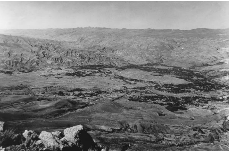
FIGURE 7 Huaraz from San Cristóbal (Schneider, 1939)