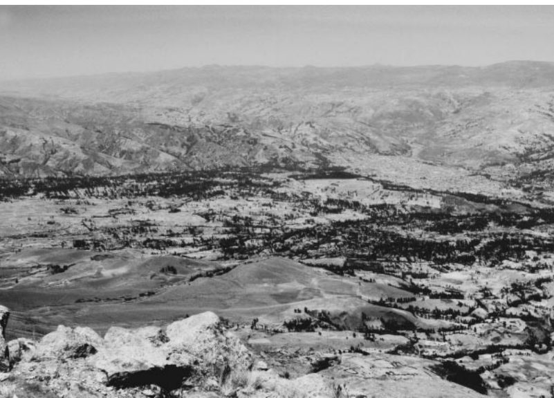
FIGURE 8 Huaraz from San Cristóbal (Byers, 10 September 1997)

induced seedling mortality were observed within the nonprotected and grazed areas at lower elevations within the valley.