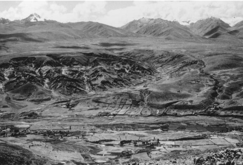
FIGURE 11 Ticapampa from the Cordillera Negra (Kinzl, 1936)