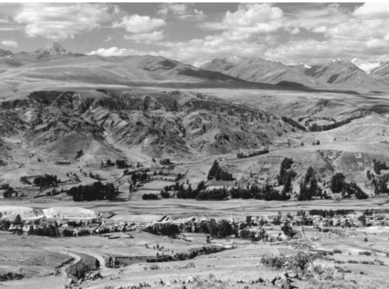
FIGURE 12 Ticapampa from the Cordillera Negra (Byers, 6 July 1998)

tion of mineral water; the spring is still active today and is protected by the small box-like structure shown in the 1997 photograph. The remaining white building with the lattice-type windows to the extreme right of center was most likely dismantled at some point well before the 1970 earthquake, as none of the informants could recall its presence prior to that time.