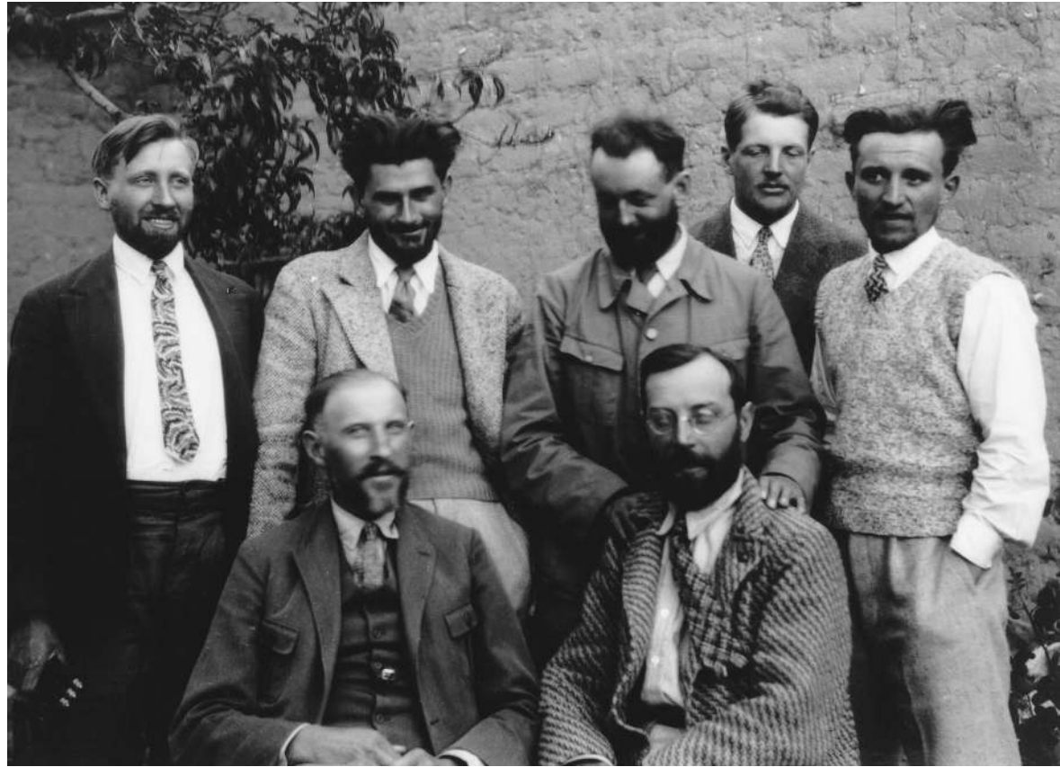
FIGURE 2 1932 German and Austrian Alpine Club expedition members.

Reserve in 1977, and a World Natural Heritage Site in 1985. The park contains 60 peaks with altitudes surpassing 5700 m, the highest being Huascarán at 6768 m. Forty-four deep glacial valleys transect the range from both west and east and, when combined with the extensive Peruvian mountain road system, provide relatively easy access for hikers, climbers, and the livestock of traditional Alpine cattle herders. Most of the terrain below 4800 m is characterized by high altitude grassland ( puna ) with remnant quenual ( Polylepis sp) forests located within the upper, inner valley slopes. Although thought to have been greatly reduced during the past century (Ejeldsá and Kessler 1996), the Polylepis forests contain a diversity of flora and fauna within the park while providing habitat for many species of endemic Andean birds. Approximately 779 plant, 112 bird, and 10 mammal species have been recorded for the region (Smith 1988; Brako and Zarucchi 1993; The Mountain Institute 1996; Kolff and Kolff 1997).