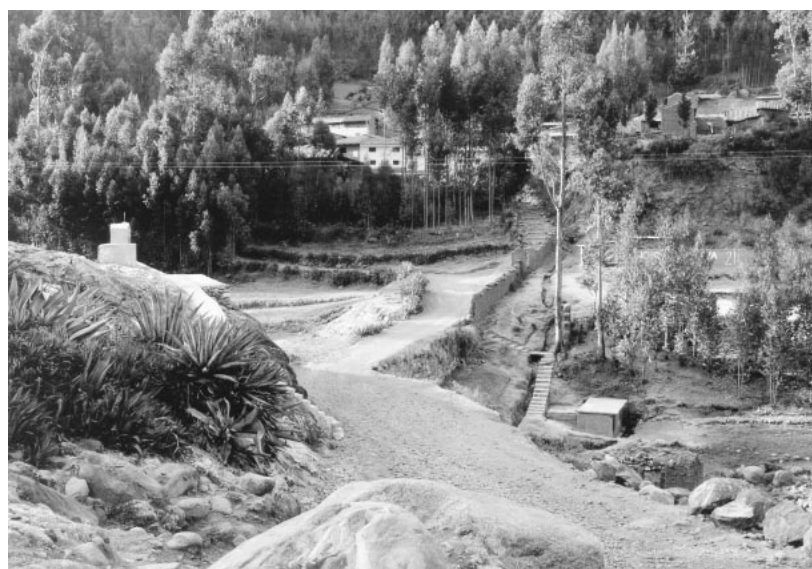
FIGURE 10 Olleros village (Byers, 11 September 1998)

length: 35 mm). The most obvious cultural change in the photograph is the absence of the 1939 housing structures near the bridge in the foreground, nearly all of which were leveled in the 1970 earthquake. Local informants remembered the two white buildings at the extreme right-center of Figure 11 as a rented high school prior to 1970, owned by a family that lived in the third white building on the old bridge. The adobe structures in the foreground were used for the produc-