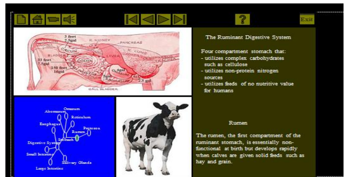
Fig1: Example of Multimedia Document

The transfer of large amounts of data will take a long time and must be done in a reliable fashion