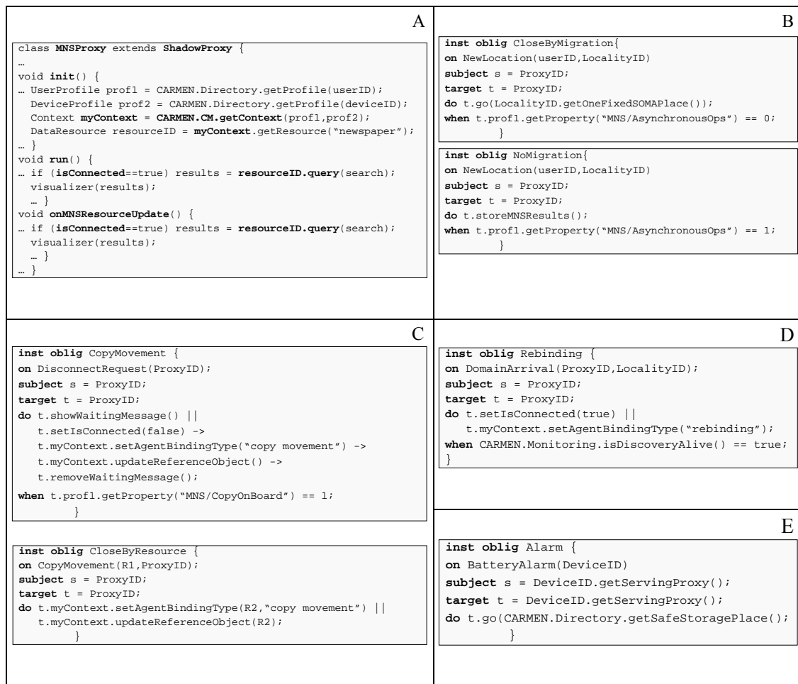
Fig. 3. A code excerpt from MNSProxy (A), migration policies for controlling proxy mobility (B), a binding policy for disconnected operations together with the related co-locality constraints (C), a binding policy for automatically updating the MNS client context after change of domain (D), and a migration policy update at service provision time (E).

Without any modification of the MNSProxy implementation, it is possible to dynamically specify different migration/binding management policies to adapt MNS to work in different operating scenarios. Fig. 3B shows two examples of different migration policies to govern the shadow proxy migration in response to Alice's movement. When she connects to the new domain LocalityID , triggering the NewLocation event, the CloseByMigration policy commands her shadow proxy to migrate to a fixed host in the LocalityID domain and to execute there. In this case, the shadow proxy follows Alice's movements to maintain co-locality. On the contrary, the enforcement of the NoMigration policy does not trigger any movement of the proxy, which continues to run in the domain of the previous Alice's connection, but produces the invocation of the proxy storeMNSResults() method. The method commands the proxy not to forward the received MNS results to the device-specific client on the companion device, but to redirect them to a disk file in the CARMEN place where the proxy is executing. This behavior is useful, for instance, to support the asynchronous collection of MNS results independently of Alice's connection/disconnection. Note that Alice can specify the MNS/AsynchronousOps attribute in her user profile to select between asynchronous/synchronous operations; the