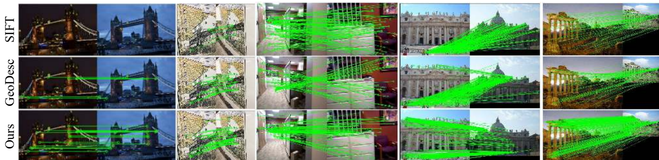
Figure 5: Matching results after RANSAC in different challenging scenarios. From top to bottom: SIFT, GeoDesc and ours. The augmented feature helps to find more inlier matches, and further allows a more accurate recovery of camera geometry.