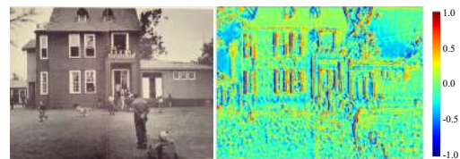
Figure 4: Visualization of matchability responding to the entire image (best viewed in color).

In the proposed framework, the matchability is learned as an auxiliary task, which is then activated by tanh and associated with keypoint coordinates as the network input, as in Fig. 2. Beside of Eq. 3, the gradient from final augmented features will flow through the matchability predictor, allowing a joint optimization of the entire encoder. The visualization of predicted matchability is shown in Fig. 4.