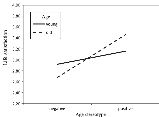
Figure 3. Age as a moderator between the relationship of age stereotype and domain-specific life satisfaction, illustrated for the domain "family and partnership." Note. "Young" and "old" as well as "negative" and "positive" represent the respective mean value \pm 1 SD.

markedly between the different domains, with the most negative ratings occurring for the domains of health and fitness, friends and acquaintances, and finances, whereas more positive evaluations of old persons were given with respect to family and partnership, religion and spirituality, and work. Absolute differences between evaluations of old persons between domains should be interpreted with caution, however, given that domain-specific age stereotypes were assessed with items differing in content and wording. Rather than reflecting purely context-specific attitudes toward old persons, the differences might also be influenced by varying difficulties of the items that were selected for the different life domains.