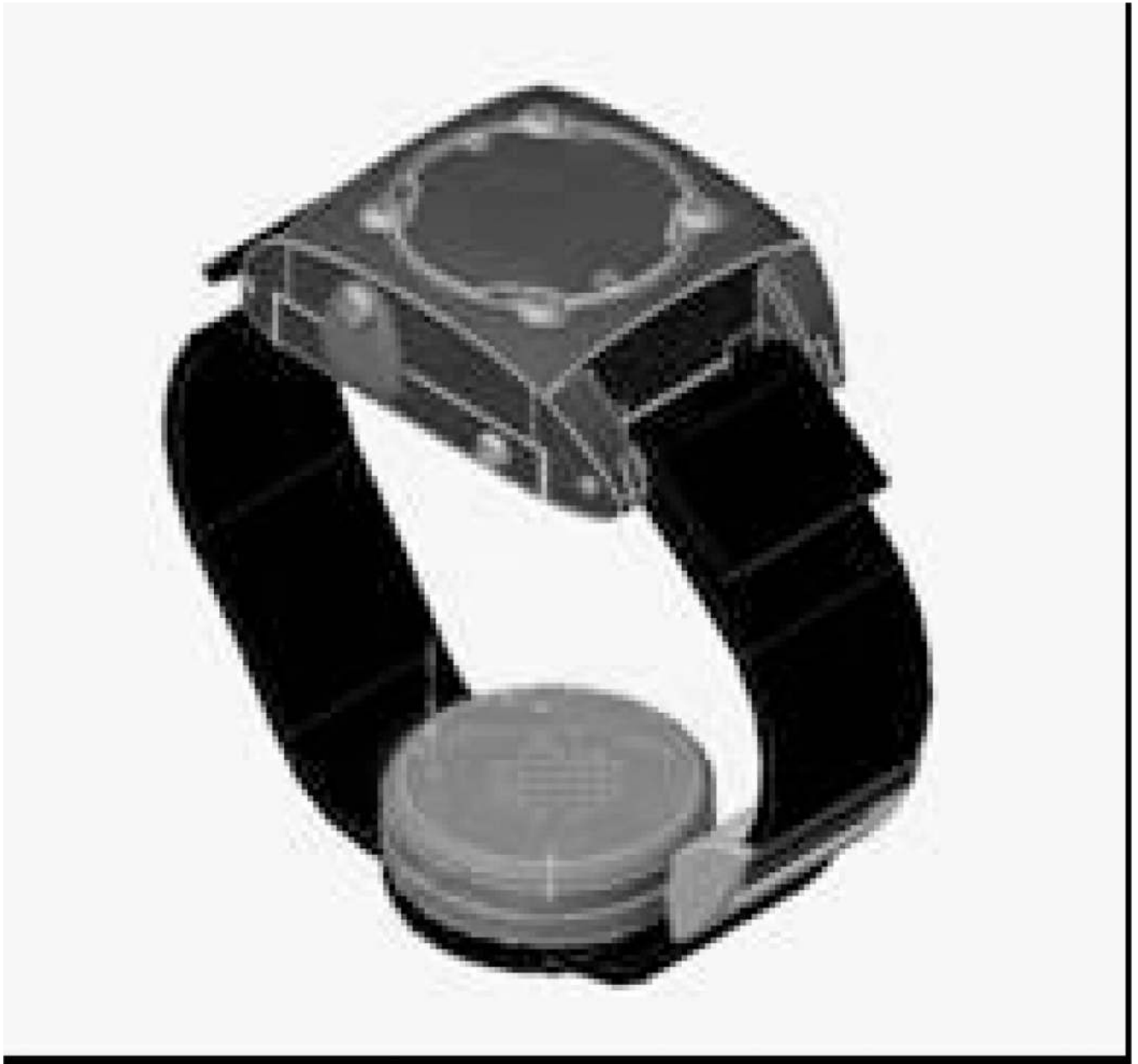
Figure 2. WrisTAS device.