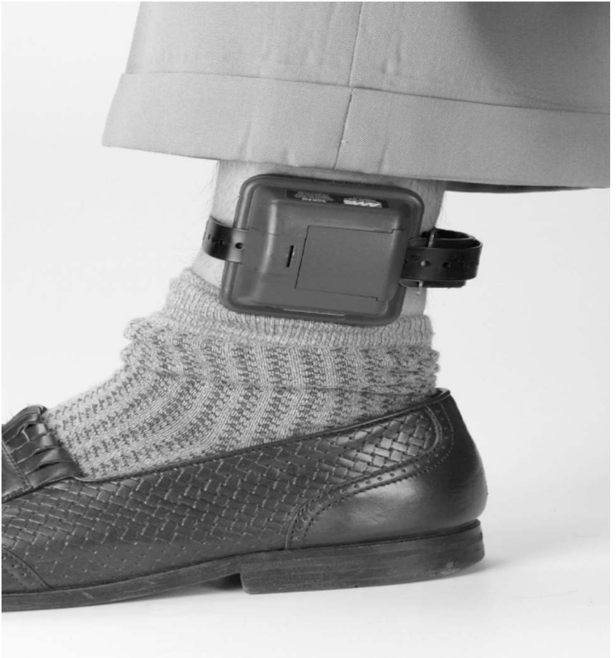
Figure 1. SCRAM bracelet device.