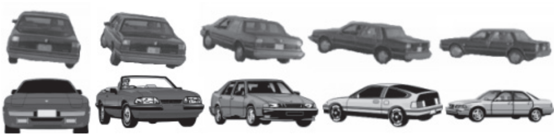
Figure 4. Results for the sequence Car-4 . Top: From left to right – segmented objects views from frames 7, 11, 15, 17 of the video sequence Car-4 . Bottom: From left to right – best matches from the database for the object view displayed above.