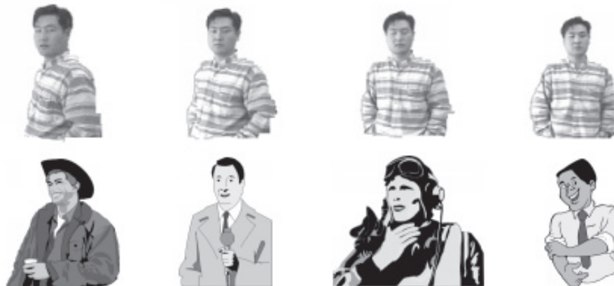
Figure 5. Results for the sequence People-2 . Top: From left to right – segmented objects views from frames 22, 26, 29, 32 of the video sequence People-2 . Bottom: From left to right – best matches from the database for the object view displayed above.

on non-rigid objects. First of all, it is straightforward to extend the database and provide more prototypes covering different motions and postures. Second, the rotation invariance of the matching procedure could be restricted. Following our approach of using canonical views, it is reasonable to allow only a certain degree of rotation when matching object views to those in the database.