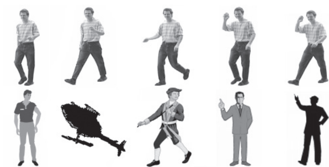
Figure 6. Results for the sequence People-5 . Top: From left to right – segmented objects views from frames 200, 204, 209, 225, 228 of the video sequence People-5 . Bottom: From left to right – best matches from the database for the object view displayed above.