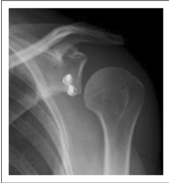
Figure 2. Inferior static subluxation of the humeral head after Latarjet procedure in a 55-year-old lady.

contraindication in older patients because we observed two kinds of special complex complications: