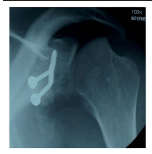
Figure 3. Typical aspect of failure after Latarjet procedure in epileptic patient: large Hill-Sachs lesion and bending of the screws.

This is also relative contraindication of the Latarjet procedure, for the above-mentioned reasons, and the