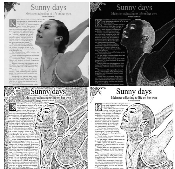
Figure 1- (Clockwise from top) - Input grayscale image, Contrast map of the input image, Output of the proposed method, Output of Niblack's method.

By this method we effectively disallow Niblack's method to work on any pixel that belongs to a region of uniform intensity. This in effect brings down the noise that Niblack thresholding would otherwise have added in these regions of uniform intensity. In addition, since we do not alter Niblack's method in any way, the extraction of text and other details of the image continue to be at-least as robust as in the original Niblack's method.