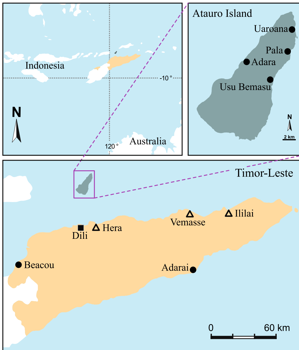
Fig. 1 Map of community sites surveyed throughout Timor-Leste. Solid circles represent communities where focus group discussions and fishing diary data were collected. Hollow triangles represent communities where only focus group discussions were conducted

occurrence of each species in the total number of samples, summed over all species groups from j = 1 to 6.