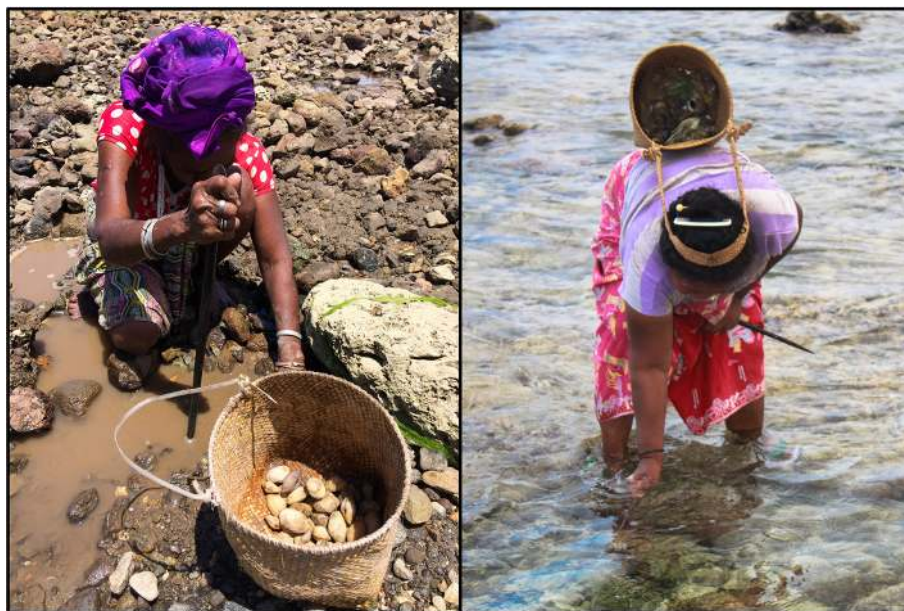
Fig. 2 Women gleaners: Digging for cockles Asaphis violascens (left pane) and probing for octopus at low tide (right pane).