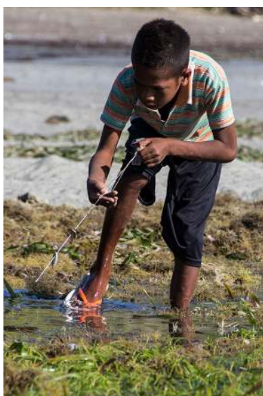
Fig. 4 A Timorese boy fishing in a seagrass flat with a small hawaiian sling ( kilat ki'ik ).

and then attempting to sell it. However, these results are insufficient to make conclusions. Mollusc and crab species represent a nutritious element of Timorese subsistence diets, but only a small number of species are targeted for commercial purposes. 84% of bivalves and gastropods species were exclusively for home consumption and played an important role to secure household protein, particularly in times of shortage and bad weather. They are available throughout the year and their distribution is relatively predictable (Thomas 2007), so decisions regarding their harvest are not necessarily determined by availability, but rather rely upon continuous tallying and assessment of all potential food resources; the dynamic reappraisal of changing food values and ease of procurement; as well as the changing estimates of group needs (Waselkov 1987). Crabs and shelled molluscs play an important role in food security, and gleaners are the primary agents in monitoring