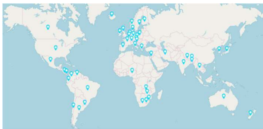
Fig. 1 Countries represented in this study

Out of a total of 109 invitees, 83 accepted nominations to collaborate in the project. Over 10 weeks between 26 February and 10 May 2018, 82 collaborators, working individually or as teams within a country, completed the questionnaires. One participant died during the study so that data were obtained for 48 of the 49 countries that came together in the collaboration (Fig. 1): Argentina, Australia, Austria, Bangladesh, Belgium, Bhutan, Brazil, Canada, Chile, Colombia, Costa Rica, Czech Republic, Denmark, Ecuador, Finland, France, Germany, Greece, Iceland, India, Iran, Israel, Italy, Japan, South Korea, Lesotho, Mexico, Nepal, the Netherlands, New Zealand, Nigeria, Norway, Panama, Poland, Ireland, Slovenia, South Africa, Spain, Swaziland, Sweden, Switzerland, Thailand, United Kingdom, United States of America, Uruguay, Venezuela, Zambia, and Zimbabwe. There were six countries from Africa, 19 from Europe, two from the Middle East, seven from Asia, two from