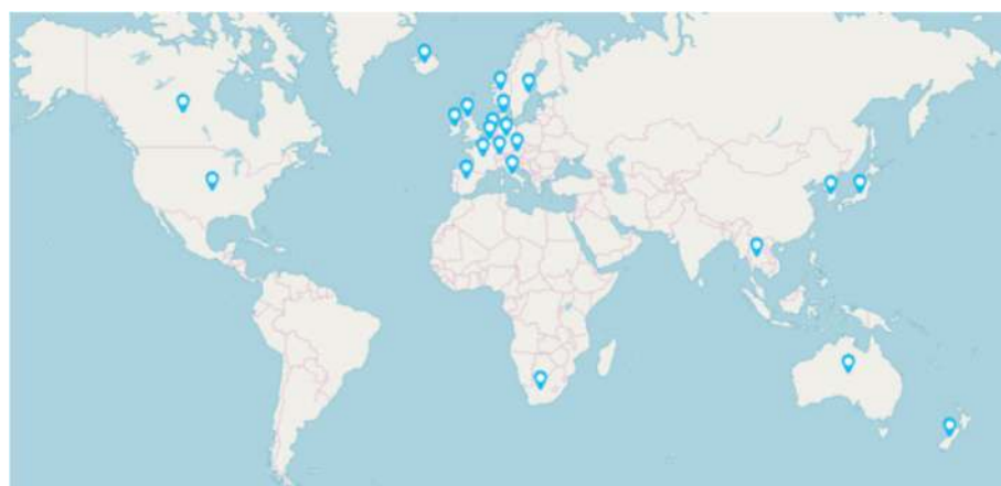
Fig. 2 Countries represented in this study that had a control program for paratuberculosis between 2012 and 2018

Europe. The majority of countries without a control program for paratuberculosis were in South and Central America, Asia and Africa (19 of 25 countries) and only 5 (20%) were in Europe (Table 6).