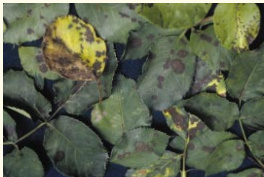
Figure 1.— Symptoms of black spot.