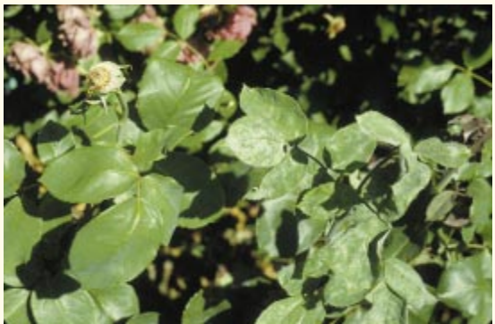
Figure 3. —Powdery-mildew-susceptible plant on the right; resistant plant on the left.