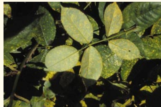
Figure 2.— Rust on both sides of rose leaves.

Spores of the fungus move from plant to plant on air currents. Newly emerging young leaves are the most susceptible to infection by the airborne spores. Within hours of landing on a leaf, spores germinate and grow into leaf tissues through natural openings.