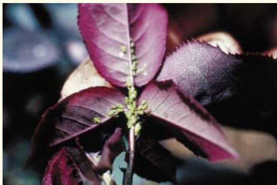
Figure 5. —Colony of aphids on underside of leaf.