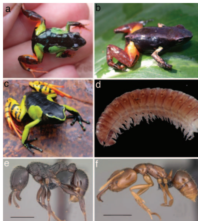
Fig. 1. Mantella poison frogs and their putative arthropod prey that contain the same defensive alkaloids. (a) M. madagascariensis (shown actual size). (b) M. bernhardi . (c) M. baroni . (d) R. purpureus . (e) T. electrum . (f) A. grandidieri . (Scale bars, 1 mm.)

Alkaloid Analyses. Methanol extracts of arthropods and frogs were analyzed for alkaloids by GC-MS on a GC-TOF mass spectrometer (GCT) (Micromass, Manchester, U.K.) in electron-impact and chemical-ionization (with NH 3 ) modes. A 30-m × 0.25-mm i.d.