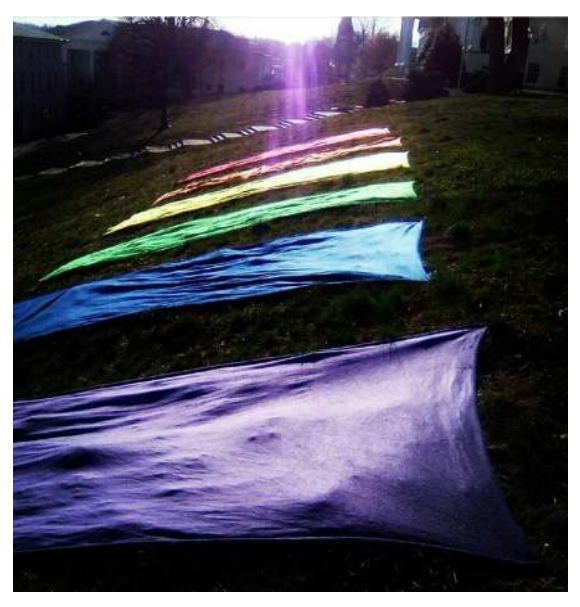
Figure B. Rainbow flags displayed prominently on the Mary Baldwin University campus for National Coming-Out Week.

From the photographs, the student-artists identified common themes and issues and from these, collaboratively developed a short set of four interview questions, listed below.