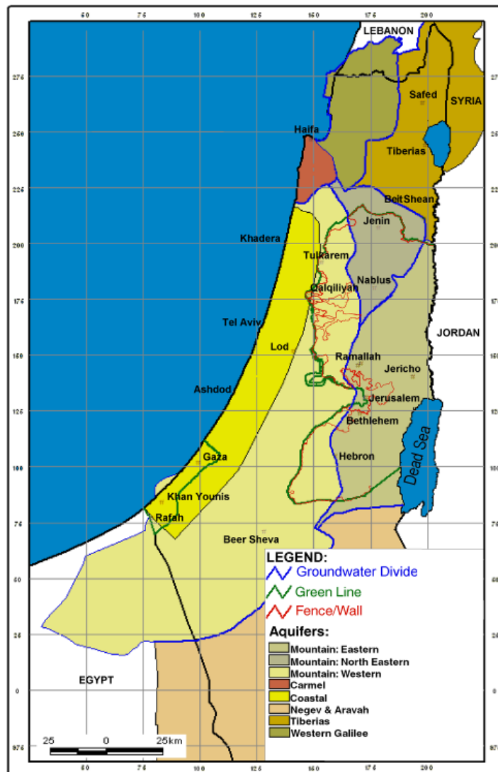
Figure 1. Transboundary Israeli-Palestinian water resources.