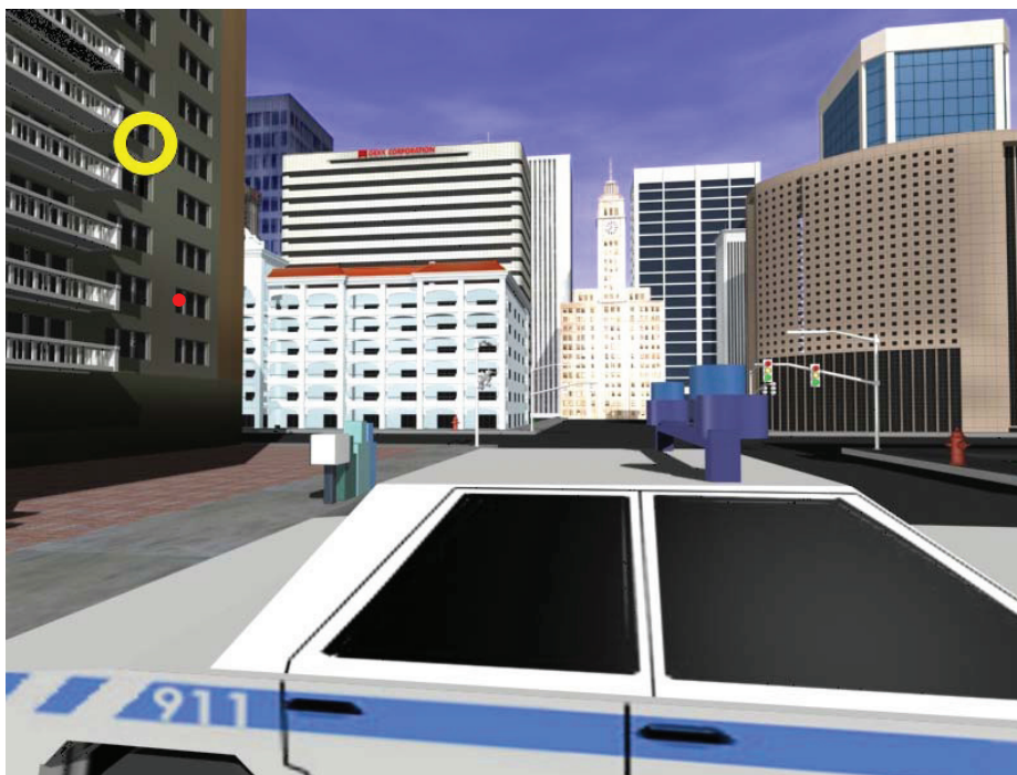
Figure 1. What a participant might see in a representative shared gaze trial. Note that the yellow gaze cursor would typically be moving over the scene, reflecting their partner’s changing gaze position. No cursor was displayed in the SV and NC trials. The placement of the target, a single red pixel (the size is exaggerated in the figure for illustrative purposes), varied in position from window to window and building to building. To view this figure in color, please see the online issue of the journal.

tinued for a possible eight shots total. Partners were given identical instructions and were informed as to their communication condition, but they did not communicate prior to starting the experiment. There were 10 practice trials followed by 50 experimental trials.