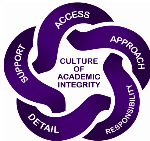
Figure 2: Core elements of exemplar academic integrity policy

Figure 2 below depicts the five elements of academic integrity policy: Access, Approach, Responsibility, Detail and Support. In keeping with our theoretical and philosophical stance (based on the work of East, 2009), we maintain that an overarching commitment to a culture of academic integrity lies at the heart of an exemplar academic integrity policy because without this commitment the five elements do not work coherently and consistently together.