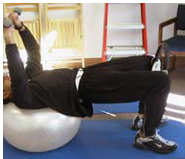
Figure 2 Bridging with shoulders on a ball.