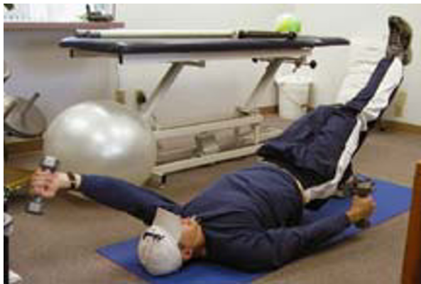
Figure 1 Keeping the transversus abdominus contracted and using the upper and lower extremities.