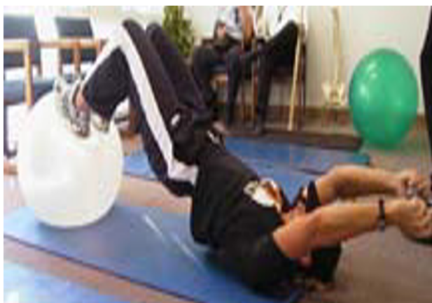
Figure 3 Bridging with feet on the ball.