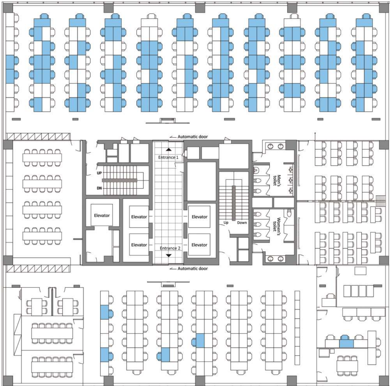
Figure 2. Floor plan of the 11th floor of building X, site of a coronavirus disease outbreak, Seoul, South Korea, 2020. Blue indicates the seating places of persons with confirmed cases.

identified 97 (8.5%, 95% CI 7.0–10.3) confirmed case-patients (Figure 1). Of 857 patients for whom demographic information was available, 620 (72.3%) were women; mean age was 38 years (range 20–80 years). Most (94 [96.9%]) of the confirmed case-patients were working on the 11th-floor call center, which had a total of 216 employees, resulting in an attack rate of 43.5% (95% CI 36.9%–50.4%) (Table 1; Figure 2). Most of the case-patients on the 11th floor were on the same side of the building. Among the 97