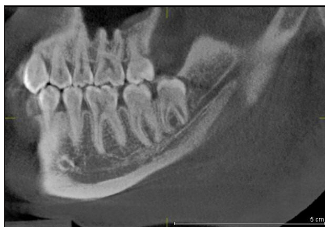
Figure 2. Multi-planer reformatted view of CBCT shows a close relationship between the impacted mandibular third molar roots and vital structures.

A full thickness mucoperiosteal incision was elevated with posterior buccal release. A conservative buccal trough was created using a round carbide bur on a surgical handpiece to allow access to the cemento-enamel junction of the tooth. Care was exercised to maintain as much crestal bone height as possible by minimising the width of the buccal trough. After exposure was obtained, a Piezzo ultrasonic instrument with angulated head (Figure 3) was used