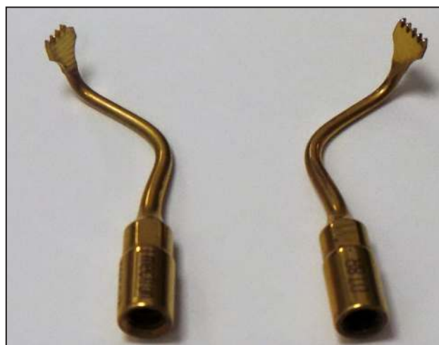
Figure 3. Bi-angulated Piezzo ultrasonic head used for coronal sectioning.

to make a horizontal cut through the tooth at the level of the cemento-enamel junction. Sectioning of the crown was performed without perforation through the lingual bone plate. The crown was delicately fractured and separated from the residual roots of the tooth using a straight elevator or chisel. Effort was directed at minimising any mobilisation of the residual roots. Upon removal of the crown, any sharp fragments of the retained tooth structure were smoothed using a diamond round bur with simultaneous copious saline irrigation.