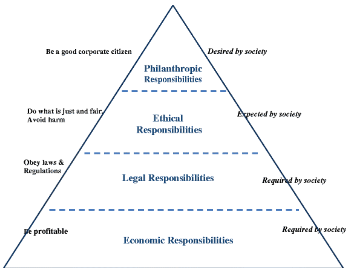
Fig. 1 Carroll’s pyramid of CSR

discretionary responsibilities, include; when they provide day-care centres for working mothers, by committing themselves to philanthropic donations, or by creating pleasant work place aesthetics. Carroll (1991) described these four distinct categories of activity by illustrating a “Pyramid of Corporate Social Responsibility”. His pyramid reflected the fundamental roles that are expected by business in society. Figure 1 presents a graphical depiction of Carroll’s Pyramid of CSR: