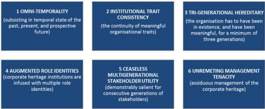
Figure 1. Balmer’s (2013) Corporate heritage identity criteria

Phase 1 of the study encompassed: examining data on TRT in the public domain; undertaking four focus group interviews (subsequently translated into English from