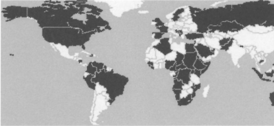
Figure 1. The Global Activity of the Privatized Military Industry, 1991–2001.

NOTE: Areas of PMF activity appear in bold.