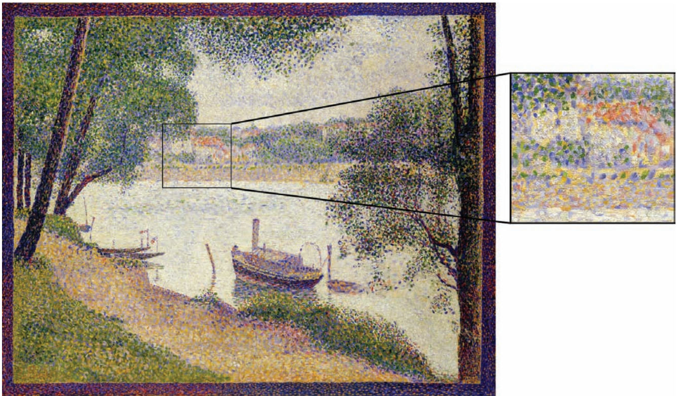
Figure 3. Gray Weather, Grande Jatte , ca 1886–1888, by Georges Seurat, The Metropolitan Museum of Art . Zooming in on details only reveals bundles of small dots of different colors. The full picture only appears when observing from a distance. Image: Peter Barritt / Alamy Stock Photo, modified by the authors.

insulation, lighting, appliances, and building design, generate cost savings from lower energy bills and make sense strictly from a private financial perspective independent of climate or other environmental benefits. In the United States, investments in energy efficiency of about $520 billion have been estimated to generate savings of $1.2 trillion (Granade et al. 2009: vii), more than paying for themselves, even without consideration of environmental benefits. In addition, reducing energy use would also improve air quality, generating large public health benefits. For example, the National Research Council estimated that air pollution damages from coal-fired electricity production in 2005 was $62 billion (NRC 2010). Rather than trying to resolve the many uncertainties we face, we can instead focus on identifying key policy relevant issues that could change the policy choice.