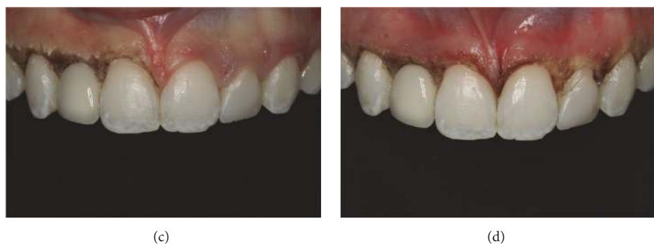
FIGURE 4: Probing after the scaling and prophylaxis sessions, performed prior to the surgical treatment (a). The smile line was marked with dental floss (b). Gingival recontour with an electric scalpel on the right side (c). Appearance immediately after gingival recontour (d).

Initial prophylaxis (CleanJoy, Cuxhaven, Germany) and scaling of the teeth were indicated prior to the surgical procedure. Despite the patient's periodontal health, it was still necessary to reconstruct gingival harmony. After four weeks, surgery was performed to increase the clinical crowns of the teeth. Probing with a millimeter probe was performed, and surgery was performed with an electric scalpel (Deltronix Bo 1300, Ribeirão Preto, São Paulo, Brazil), without the need for bone contouring. Gingivectomy was performed to achieve the desired gingival margin position, thus, improving the width-to-height ratio of dental crowns. Sutures were not needed. Following the surgical procedure, oral diclofenac sodium 100 mg was administered for 3 days. Dental prophylaxis was achieved 30, 60, and 90 days after surgery. Postoperative follow-up was done after 3 months (Figure 4).