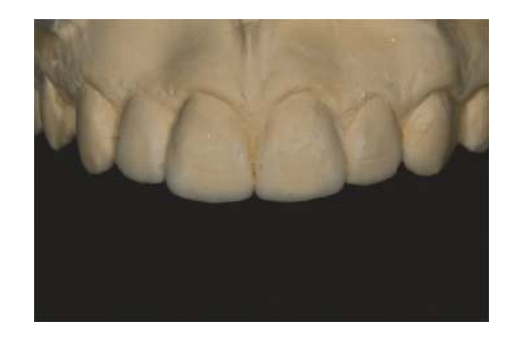
FIGURE 3: Model of diagnostic wax-up. Note the more defined and triangular contour of the buccal proximal edges.

no extractions, previous orthodontic treatment, or implants. Clinical examination revealed a composite resin on the left lateral microdontic incisor, a prosthetic implant on the right lateral incisor, and hypoplastic stains on the central incisors and maxillary and mandibular canines. In addition, the gingival concave arch was irregular but gingival inflammation was not observed. The composite resin restorations of lateral incisors also were not maintaining adequate width-to-height ratio. Radiographic examination confirmed the presence of the implant and the health of adjacent tissues (Figures 1 and 2). Models and photographs were prepared for case study. A diagnostic wax-up was done on the maxillary arch model (Figure 3).