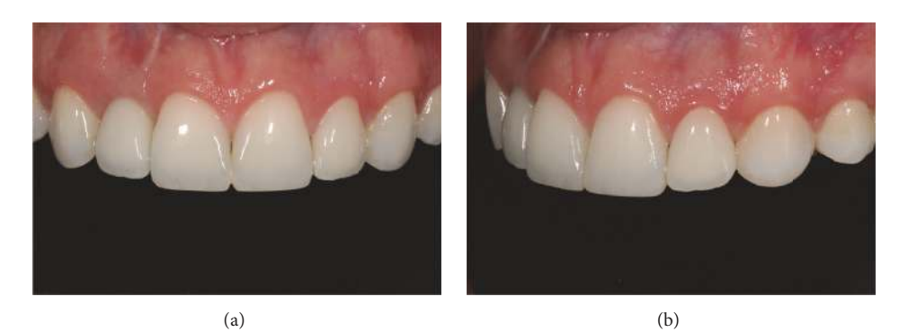
FIGURE 9: Front (a) and left (b) detail of resin restorations combined with ceramics.