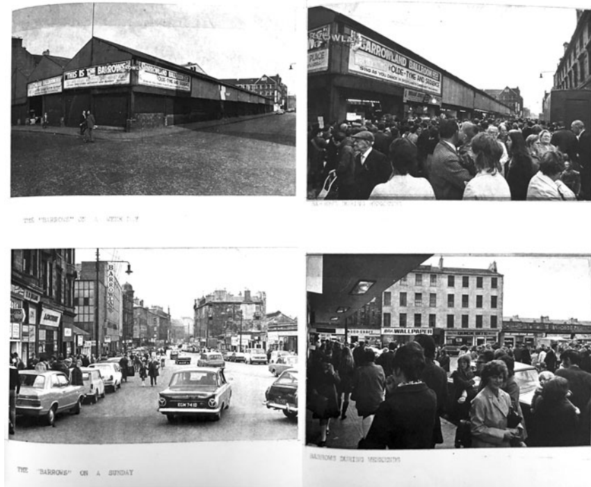
Figure 2: Clockwise from top left: 'The Barrows on a weekday'; 'The Barrows on a weekend'; 'The Barrows on a Sunday'. Mansley, Glasgow East Flank , 12–13.

sought aspects of the market that were hidden from the planners' objective gaze: the affective draw of its form and tradition, the changes in class structures that either helped or hindered the institution's longevity and the weight that individual consumers gave 'bargain' shopping vis-à-vis the potential disruption of motorway construction.