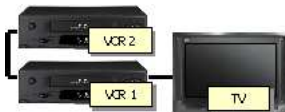
Fig. 2. An example AV.Link configuration

Customers of AV devices often purchase their devices from many different manufacturers, connect them in different combinations, at different moments in time. This requires an interconnection system that is extendable and suited for the interconnection of existing devices as well as new devices. The AV.Link standard specifies a protocol for control-oriented data communication between a chain of AV devices (such as a TV, a VCR, a satellite decoder, etc.) that meet these requirements. Communication is defined over a single, unused pin of the peritelevision connector (which is present on most AV devices). Figure 2 depicts three AV devices hooked up by means of AV.Link.