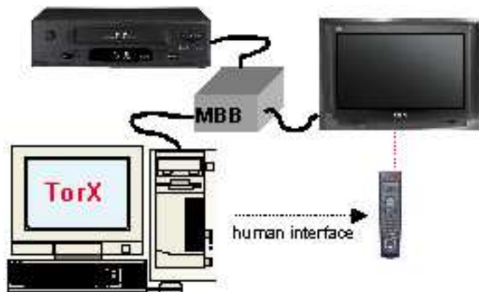
Fig. 3. EasyLink test environment

To test the Preset Download feature of the EasyLink protocol a test environment has been set up. The test environment consists of a TV that is indirectly connected to a single VCR via an intermediate device (MBB). This intermediate device is also connected to, and controlled by, a host computer running our tester (TORX) via a serial link. The MBB allows the host to monitor the messages between the TV and the VCR. It also allows the host to upload messages to the TV or VCR. The TV can be operated by a uni-directional remote control remote control. The remote control is controlled by the host computer via a human interface. Figure 3 depicts the test environment that was used.