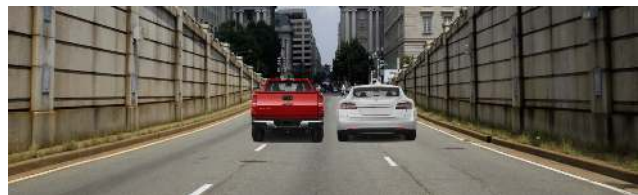
(a) \mathbf{m}^{(1)} = (53, 25, 2, 0.11, 0.98, \dots, 0.50, 0.41, \dots)

Once a modification is fixed, our picture generator renders the corresponding image. The concretization is done by superimposing basic images (such as road background and vehicles) and adjusting image parameters (such as brightness, color, or contrast) accordingly to the values specified by the modification. Our image generator comes with a database of backgrounds and car models used as basic images. Our database consists of 35 road scenarios (e.g., desert, forest, or freeway scenes) and 36 car models (e.g., economy, family, or sports vehicles, from both front and rear views). The database can be easily extended or replaced by the user.