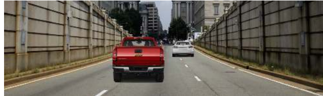
(b) \mathbf{m}^{(2)} = (53, 25, 2, 0.11, 0.98, \dots, 0.20, 0.80, \dots)