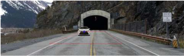
Figure 3: Annotation trapezoid. User adjusts the four corners that represent the valid sampling subspace of x and z . The size of the car scales according to how close it is to the vanishing point.

point from \mathbb{M} , which guarantees a good mix of generated images for both training and testing. Although a simple and effective technique for both training as well as testing, it may not provide a good coverage of the modification space;