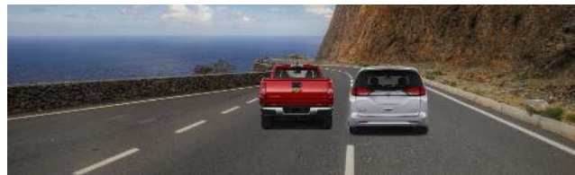
(c) \mathbf{m}^{(3)} = (13, 25, 7, 0.11, 0.98, \dots, 0.50, 0.41, \dots)