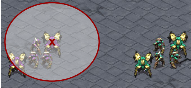
Figure 2: Starting position with example local field of view for the 2d_3z map.

To create a more challenging benchmark that is meaningfully decentralised, we impose a restricted field of view on the agents, equal to the firing range of ranged units’ weapons, shown in Figure 2. This departure from the standard setup for centralised StarCraft control has three effects.