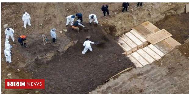
Fig. 2 An unimaginable mass grave in New York

While more than half of the world population locked down to contain the spread of COVID-19, accusations and counter accusations have surfaced in different parts of the world. Some of these accusations are aimed against certain ethnicities and religious minorities, which are divisive in a time when unified approach is required. Many of the accusations are centered on the action plans of different countries and the origins of the virus itself. It is a general belief that many governments did not take the threat of COVID-19 serious enough. Reported by The Guardian, Leader of the Democratic Party in the US, where more than