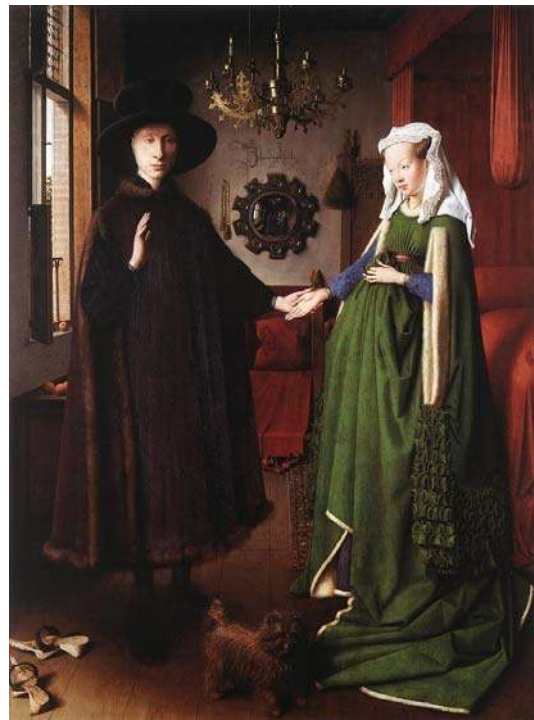
Portrait of Giovanni Arnolfini and his Wife (1434) By Van Eyck, National Gallery, London

ironically or otherwise. One such precursor, in fact acknowledged in the editorial notes to A Conversation Piece , and whose productiveness to any reading is magnified by the vastness of its cultural and representational consequence, is one of the fundamental pictorial topoi for the representation of the married couple in European art —Van Eyck's Portrait of Giovanni Arnolfini and his Wife 1 .