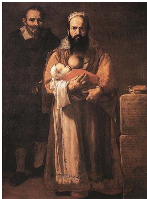
The Bearded Woman (1631) by José de Ribera Hospital de Tavera, Toledo

As readers of Muldoon’s work are bound to remember, the theme of mongrel identity had its most memorable anchorage in his 1977 collection Mules , and within it an openly autobiographical realisation of that theme with regard to family identity could be found in the aptly titled “The Mixed Marriage”, a poem about a “servant-boy” father and a “school-mistress” mother which contained a motto for Muldoon’s poetically recurrent sense of an in-between origin and identity: “I flitted between a hole in the hedge / And a room in the Latin Quarter” (Muldoon 2001: 60). But both themes had another meeting point in that volume, and one which was matched by an intermedial design: the ekphrastic poem “The Bearded Woman, by Ribera”.