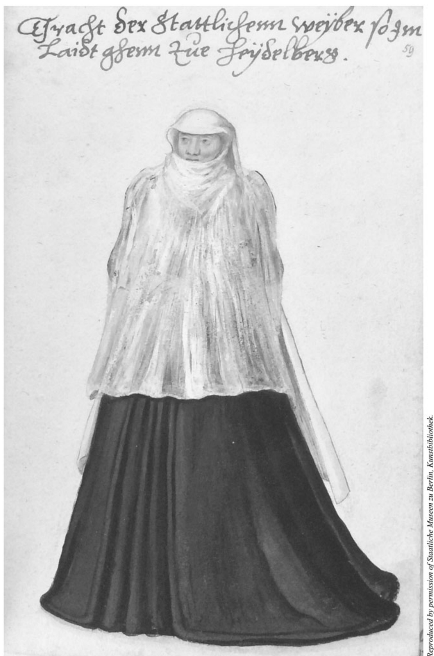
Fig. 6. 'Mourning dress of noble women in Heidelberg'. From Deutsches Trachtenbuch , 1560–1594, fol. 59.