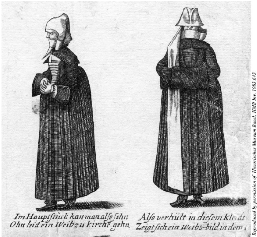
Fig. 12. Left: 'The headgear of a woman on the way to church who is not in mourning'; right: 'This is how a woman appears when in mourning'. Both wear sturzh and tüchli . From Johann Jakob Ringle, Amictus , 17 th century, no. 19 (detail).

down over the back and was described as 'a highly pernicious excess', and were only permitted the ' nidergelitzten Stürtze ' (turned-down veil). 68 Two years later, following the suppression of the revolt, the women of Basel were once again, in 1692, explicitly forbidden to appear at early sermons on weekdays or for evening prayers in their 'petticoat' ( Underrock ) without Sturz and Tüchlin ; instead, they were enjoined to 'dress and appear in the hitherto customary and honourable church garb'. 69 There was no longer any mention of banning the Sturz . Nevertheless, a new sumptuary ordinance issued in 1704 permitted prosperous women who wore the Sturz to attend communion to open their scarf ( Tüchlein ) when they wished: