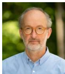
Tillman Gerngross, Dartmouth College.

historical reliance on Chinese hamster ovary (CHO) cell manufacturing, and therefore high-value (tens of thousands of dollars per infusion per patient), high-impact markets are preferred. This manufacturing and pricing model is not well aligned with infectious disease, where very large numbers of doses may be required and are expected/need to be relatively affordable due to community expectations around costs of antivirals and antibiotics.